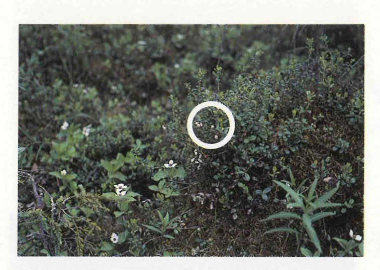
Figure 1. Blossoms of lingonberries.

Hultén (1949) divides this circumpolar species into two races relating to adaptations to its ecologically diverse range. The lowland subspecies, vitis-idaea , occurs in Europe and northern Asia and joins the arctic-montane subspecies, minus in the mountains of Scandinavia. Subspecies minus grows in North America and Europe and is the race found in Alaska. Throughout this range, the lingonberry is known by more than twentyfive common names including cowberry, lowbush cranberry, foxberry, partridge berry, and mountain cranberry.