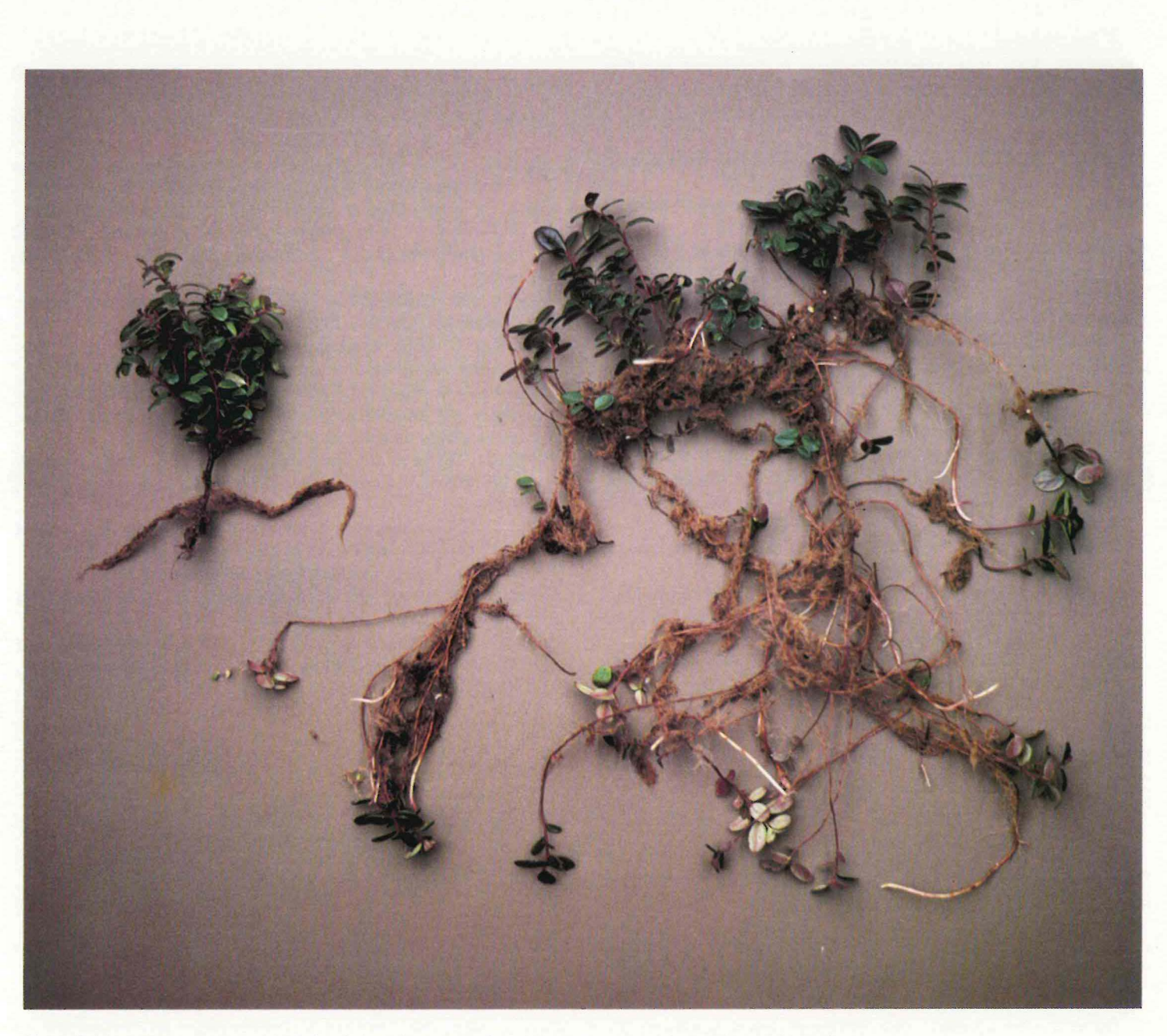
Figure 3. Lingonberry plant on the left is a 2-year-old stem cutting while plant on the right is a 2-year-old seedling.