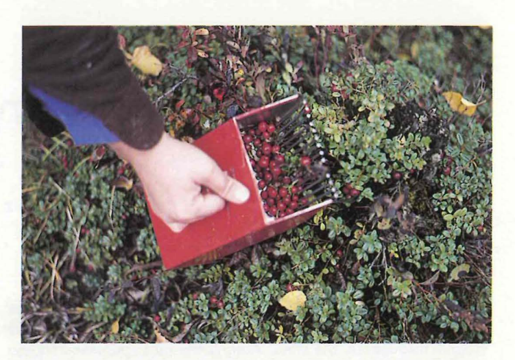
Figure 2. Ripe fruit of lingonberries.

In interior Alaska, the pink bell-shaped flowers of the lingonberry appear in early June with full bloom lasting from 19 to 27 days (fig. 1). Clusters of green berries ripen to a deep burgundy from late August through September, approximately