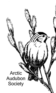
Arctic Audubon Society