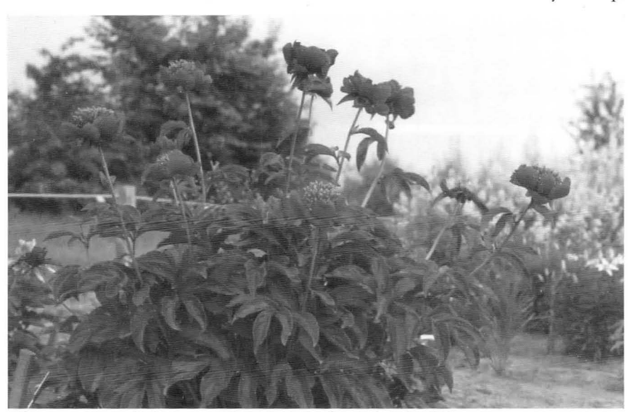
Charm peony at the Georgeson Botanical Garden, July 24, 2002.

Before a fertilizer program is initiated, the soil always should be tested for nutrient content. The increased water requirement of cut flowers increases fertilization requirements. Fertilizer is applied as needed. One to two pounds of actual nitrogen per 1,000 square feet of production area per year of a 1-1-1 ratio fertilizer is adequate for plant growth and flower production. One half of the annual amount of fertilizer is applied at the time of shoot emergence in the spring. The second half can be applied after the plants go dormant in the fall. Keep all fertilizers away from the crowns and spread it over the area where the roots grow, 6-18 inches from the crown. The fertilizer is worked thoroughly into the soil around the plants. Avoid applying too much nitrogen.