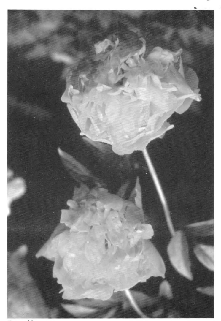
Peony blossoms.