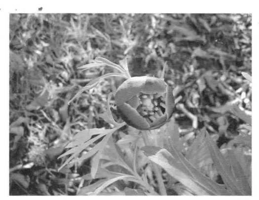
Left: Paeonia californica, California Peony, a wild species