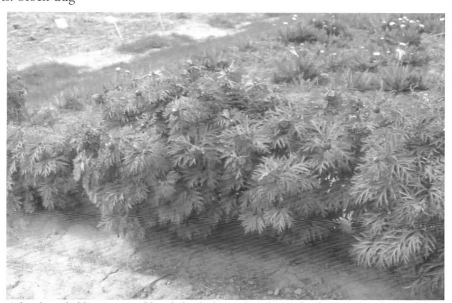
A hardy early bloomer, possibly a hybrid, donated to the garden by Jana Gordon.

Disbudding is the removal of lateral flower buds growing in the leaf axis so that all of the plant's resources contribute to one flower per stem, which enhances growth of the terminal flower bud. It is done when the auxillary buds are barely