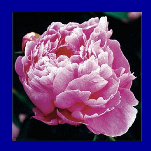
Duchess de Nemours