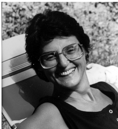
University of Alaska Fairbanks School of Natural Resources and Agricultural Sciences