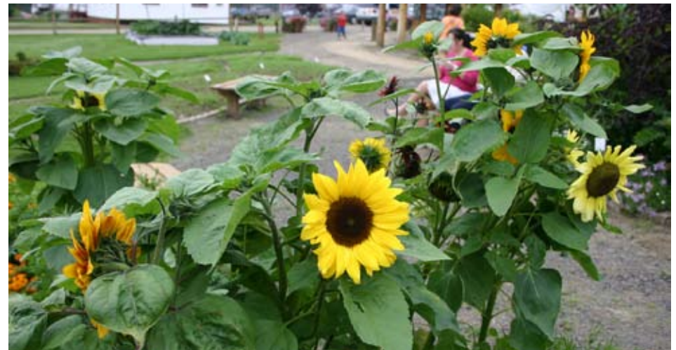
Helianthus annuus , or sunflowers, growing in the Georgeson Botanical Garden.

USDA Plant Introduction Stations, NC7, Iowa State Univ, Plants and seeds