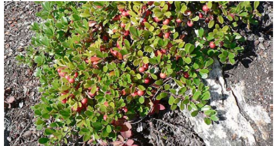
Arctostaphylos uva-ursi, or kinnikinnik.