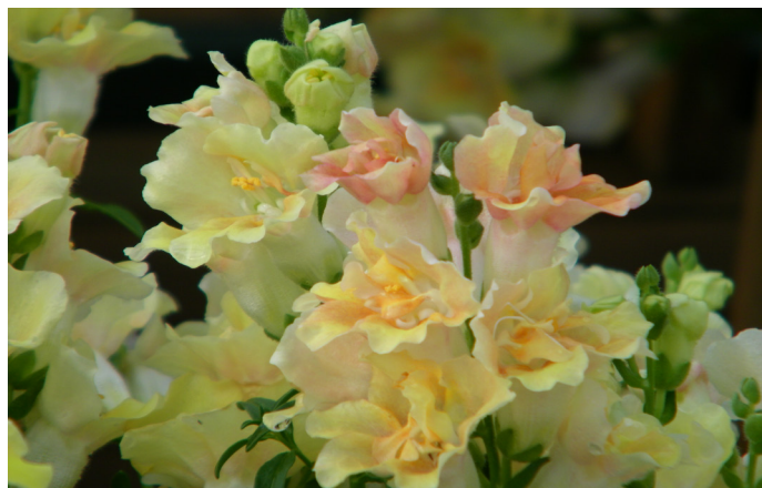
Dwarf snapdragon 'Twinny Peach'

There were four flower winners in the All America Selections program this season three of which were grown in the garden this past summer. All three are worth testing in home gardens and landscapes in 2010. Top on my vote for this year is a dwarf snapdragon , 'Twinny Peach' This little ten-inch ground hugger is an open-faced or butterfly type snapdragon that is far superior to any dwarf snap on the market. What I hate most about dwarf snapdragons is their very short bloom time. No sooner does the rest of the garden begin to bloom, then the dwarf snaps go to seed. Deadheading is a must followed by several weeks before new blooms appear. Most are not worth the time and effort, but 'Twinny Peach' is different. Our plants were in full bloom from transplanting in June through mid August and continued to show color until frost. Deadheading was occasional rather than a continuous chore. Most interesting of all is the color – the two toned pink and creamy yellow is gorgeous! It is truly a milestone in snapdragon breeding and one worth growing in Alaska gardens.