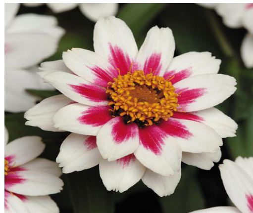
'Zahara Starlight Rose' Zinnia pictured at right

The 'Zahara Starlight Rose' Zinnia is a new species to our trial gardens, Zinnia marylandica . The plants are bushy mounds of color similar to the Pro-fusion Series that is so popular mostly because of their eye popping colors and no maintenance needed. 'Starlight Rose' , on the other hand is not packed with flowers, and deadheading is a