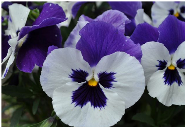
Viola 'Endurio Sky Blue Martien'

One other 2010 winner, Viola 'Endurio Sky Blue Martien' , a little lavender viola was an AAS Cool Season award winner, so we did not receive seeds in time to have them in trials this season. As usual, the plant height is advertised as 6 inches like many other violas. No doubt, when we do get to grow this winner, it will smash the height records. Like the giant cabbages but not as noticeable, violas in Alaska gardens routinely form giant mountains of flowers sometimes 24 inches tall! Gardeners don't even notice the difference until they read the catalog description and learn their plants are supposed to grow only a quarter that size.