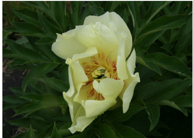
Itoh hybrid peony, "Going Bananas"