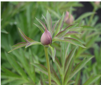
Flower buds of Itoh (Intersectional) hybrid peonies (left) and lactiflora hybrid (herbaceous) peonies (right)