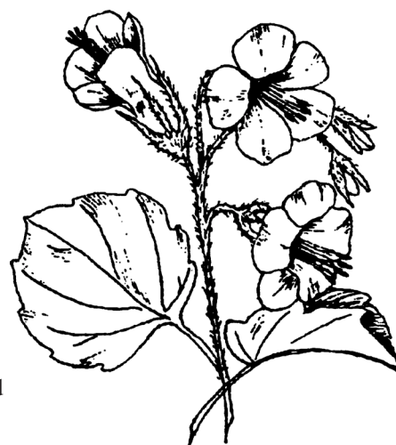
California bluebell, Phacelia campanularia

simply that they tell us which mix they preferred, and provide comments on their choice. Participants included individuals from many Alaska cities as far away as Homer and Ketchikan as well as world travelers from Germany, Sweden and France. The most frequent comment was that all of the mixes were beautiful and choosing one was nearly impossible. Despite the indecision, two mixes appeared to be clear favorites. The Golf Course Mix received the most votes beginning the last week of July. People liked the multi-colored mix because it showed a rainbow of colors very early that persisted for several weeks. This mix also had a shorter height than some of the others with less stratification of flower colors due to crowding. People commented that the shorter height permitted children as well as adults to enjoy the entire display, and the "greens" were low enough for flowers to be clearly visible. Interest in this mix began to