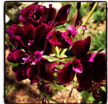
'Black Magic Rose' geranium was a winner this year.

A plant for the garden and containers is 'Black Magic Rose' geranium. The rich chocolate leaves edged with green were not very striking in the greenhouse, but outdoors, they stood apart from all the rest. The plant grew better than most geraniums in the ground beds and filled in well, reaching a