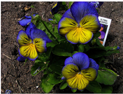
'Ultima Morpho', a stunning possibility for your garden.

The All America Selections Program awarded some great winners for 2002 that will perform well in Alaska's gardens. Our flower favorite was a pansy called 'Ultima Morpho' that was definitely an eye-catcher. It was named after a butterfly called Morpho with similar colors on its wings. Most of the flowers were a beautiful mix of bright blue and yellow, a color combination not seen before in pansies. Some were nearly fully yellow. But the effect was electric. It bloomed all summer long with great 12-inch mounds of flowers. This is definitely worth trying.