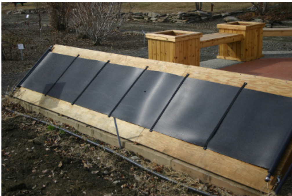
Figure 1. Solar heater for drip irrigation water.

There was no difference in tomato yield between the solar heated rows and the untreated rows, but there were differences in soil temperature during and after irrigation. In the unheated (control) plots there is a daily cycle with a soil temperature minimum at about 8:00 am and a maximum at about 6:00 pm (Fig. 2). The amplitude of these cycles is dependent upon the amount of solar energy captured by the IRT mulch during the day and is greater on warm sunny days than on cloudy days. The plots with solar heated irrigation water follow an almost identical cycle until they are irrigated and then the addition of heated water causes a sharp rise in soil temperature (Fig. 2, 3). The solar heated plots remain warmer than the control plots