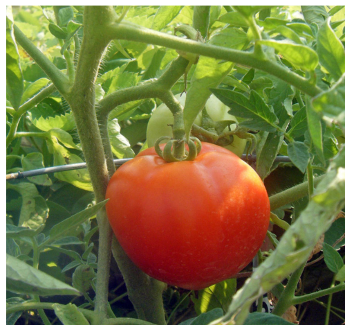
'Northern Delight' tomato.