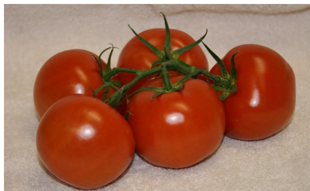
'Prairie Fire' tomato.