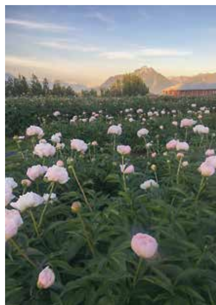
› South Central Region – Wasilla Lights Farm, Wasilla, Alaska. Submitted by Kelly Dellar.

expanded, and new growers organized the Alaska Peony Growers Association to share successes and failures. Early communication among researchers and growers provided a critical link to success especially considering the size of the State and the distances among farms. The number of farms steadily grew, and currently, there are 136 peony farms in Alaska. They range in size from 0.10 to 6 ha.