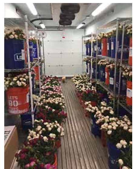
› Peonies in on-farm refrigerator. Fox Hollow Peonies, Nenana, Alaska. Submitted by Wanda Haken.

In humid and rainy parts of Alaska, a black, sooty mold fungus grows on the nectar, especially the quantities that collect at the base of the flower bud. The buds must be pre-treated with a fungicide or individually washed after harvest to remove this mold before sale. Some growers include honey bee hives in their peony fields, and they are very efficient at collecting the nectar and minimizing the mold problem. Sooty mold is a problem in the South Central and Kenai Peninsula Regions, but not Interior Region. Occasionally, aphids will appear on peonies but mostly in fields surrounded by birch trees ( Betula alaskana ). Two significant insect pests are thrips and lygus bugs. Thrips cause bud distortion, bud abortion, flower drop and bruising on petals. Up to 12 species of thrips have been identified including western flower thrips that can cause flowers to be rejected during inspections for foreign shipments. Dr. Beverly Gerdeman (Entomologist, Washington State University, Mt Vernon, WA) has shown