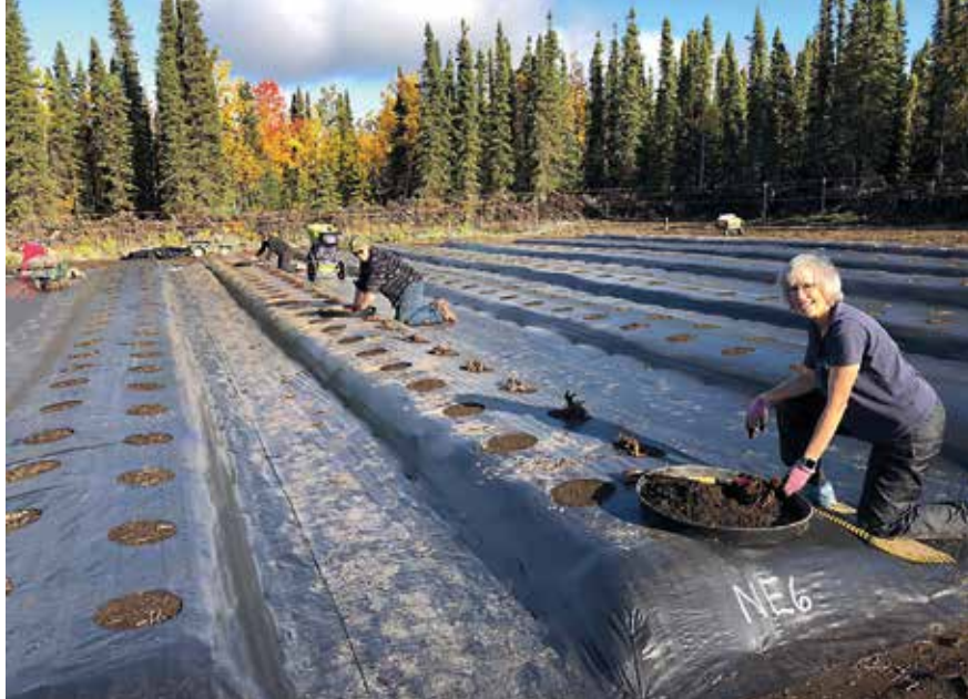
› Peony field with landscape fabric for weed control. Funny River Peonies, Soldotna, Alaska. Submitted by Denise Carey.

Prior to shipment, stems are re-hydrated in warm water for 15-30 minutes. Stems may be bundled into sets of five, or held in large upright bundles for transport depending on market demand. Flowers are packed into boxes lined with newsprint or dacron® sheets. Ice packs are often included, but temperature effects only last a maximum of 10 hours in transit.