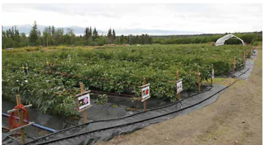
▶ Alaska's oldest peony farm, Alaska Perfect Peonies. Submitted by Rita Jo Shultz.

In general, when sepals separate, peony petals show true color, and the buds begin to soften, harvest begins. In the North, where daylight can reach nearly 24 hours, harvesting occurs nonstop for 12-14 hours per day. If the markets are wholesale distributors or if they require long distance transport, buds