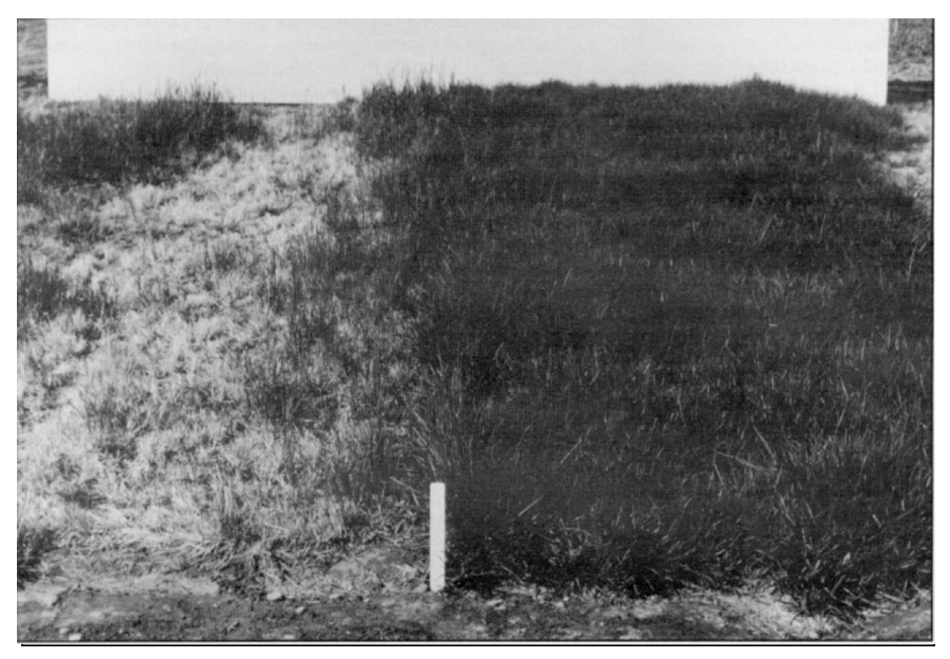
Figure 2. Comparative winter hardiness of two Kentucky bluegrass strains of dissimilar latitudinal adaptation: (left) midtemperate-adapted Delta from southern Canada and (right) subarctic-adapted strain "412" from Iceland. Plots planted 19 June 1974; photo 5 June 1975.

postulate that auxins (growth regulators) within the plant suppress the development of basal tillers during the time of rapid culm elongation; they found high growth-regulator activity at the early jointing (culm elongation) stage and a significant drop in growth-regulator activity just prior to anthesis and preceding the period when active tiller growth resumed.