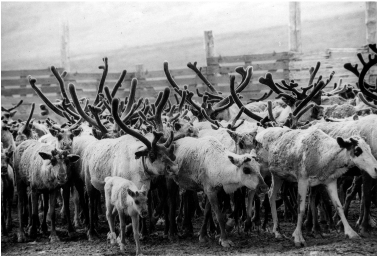
Reindeer in the Davis corral during summer handling.