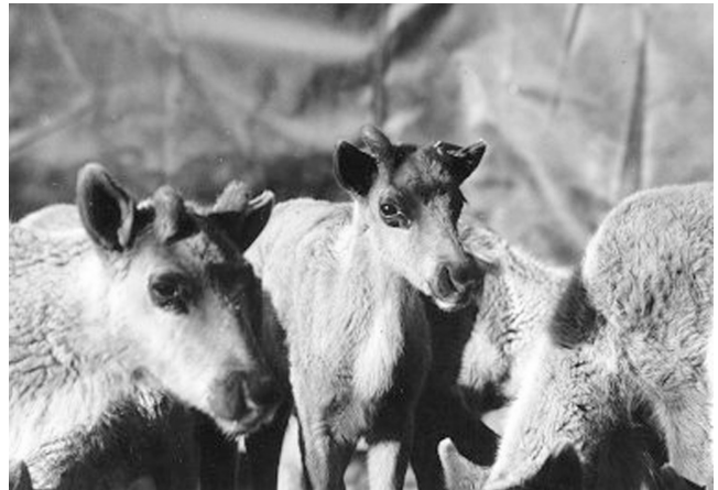
Reindeer calves in July.

mate survival rates. The model was calibrated using reindeer herd records from 1984–1997. Output includes changes in herd size and composition over a thirty-year period, meat production, antler production, female: male ratio, and predicted net income. The model illustrates the sensitivity of herd size to female adult survival rates.