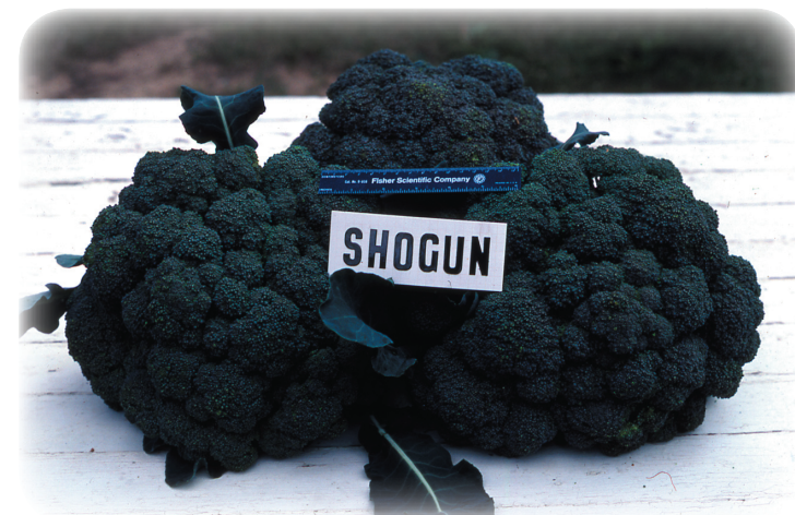
Two vegetable varieties tested in 2003. Above: Shogun broccoli. Left: OS Cross cabbage.