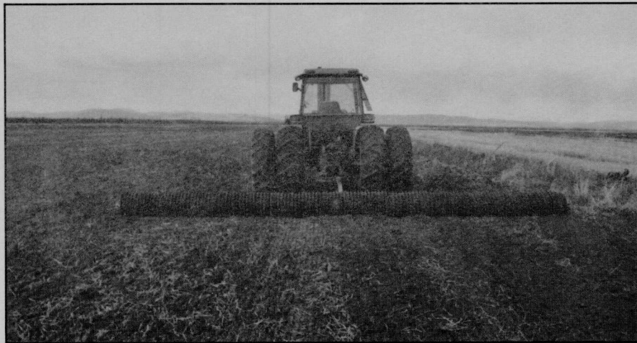
Figure 2. Immediately following disking, the seed bed was packed to reduce moisture loss.