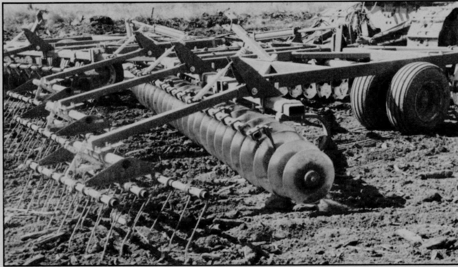
Figure 1. The seed bed was prepared using a disk with harrows to incorporate trifluralin and to provide a smooth surface.