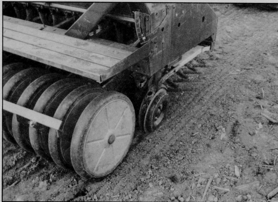
Figure 3. The seeder used was equipped with depth bands to ensure shallow, uniform depth of seed placement and packer wheels to provide soil-seed contact.

The trifluralin that was applied in the spring controlled broadleaf weeds except for a few areas along old berm rows. Insects did not appear to affect the crop.