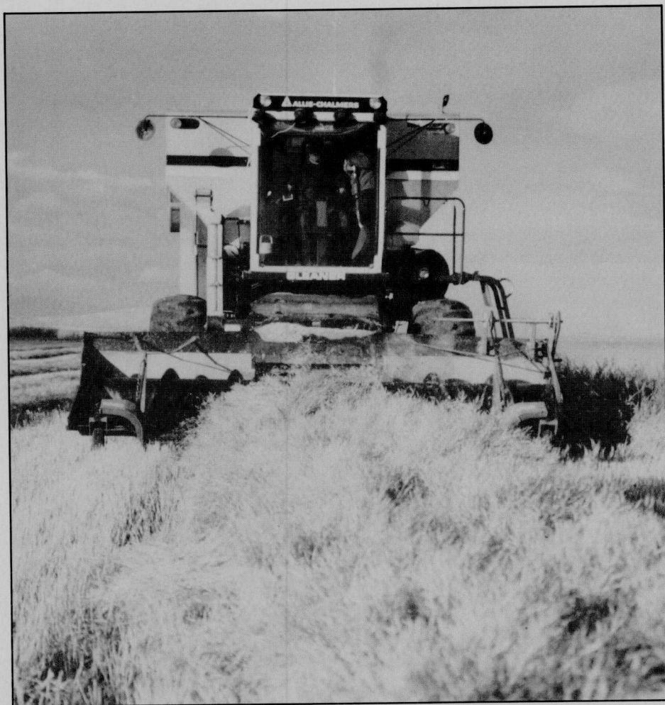
Figure 5. The fan speed and screen adjustment on the combine must be set accurately to minimize loss of seed during the operation.