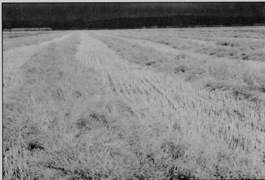
Figure 4. Swaths of rapeseed were loose and provided a mechanism for seed drying.

Yield, as calculated by the quantity of rapeseed placed in storage, was approximately 25 bushels per acre. This is considered an average to good yield. Minor losses due to shattering in the swath were noted. Test weights ranged from 49.8 to 50.3 pounds per bushel. Standard test weight is 50 pounds per bushel.