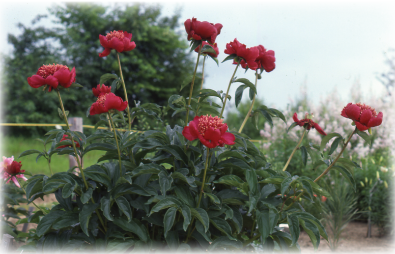
Charm peony at the Georgeson Botanical Garden, July 24, 2002 —Georgeson Botanical Garden Collection.

applied as needed. One to two pounds of actual nitrogen per 1,000 square feet of production area per year of a 1-1-1 ratio fertilizer is adequate for plant growth and flower production. One half of the annual amount of fertilizer is applied at the time of shoot emergence in the spring. The second half can be applied after the plants go dormant in the fall. Keep all fertilizers away from the crowns and spread it over the area where the roots grow, 6–18 inches from the crown. The fertilizer is worked thoroughly into the soil around the plants. Avoid applying too much nitrogen.