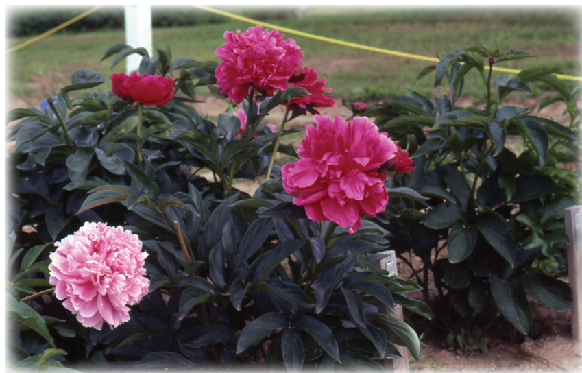
Peonies at the Georgeson botanical Garden, summer 2002. Martha Bullock is the light variety at lower left, Kansas the darker blooms at right—Georgeson Botanical Garden Collection.

Choose a drying substance such as white cornmeal, sand, borax, kitty litter, silica gel, or a specially formulated product. Avoid anything that will soil the flower or be difficult to remove. Place the flowers with stems removed on a ½- to ¾-inch layer of drying substance in a container two to three inches deep. Carefully pour the drying substance over, around, and through the petals to cover the flowers. Instructions regarding light, temperature, and timing vary with the drying material. Books such as the one listed in Further Reading at the end of this article describe specific handling methods for each material.