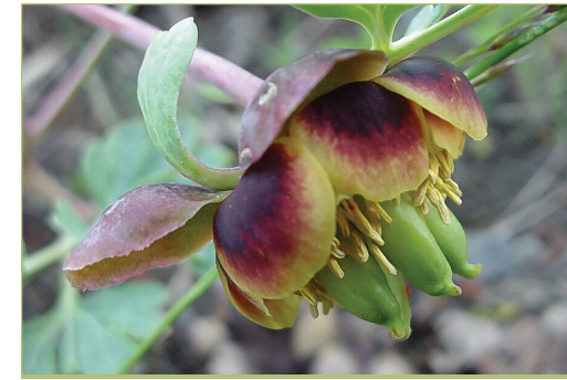
Wild Mountain Peony, Paeonia brownii , growing in California.