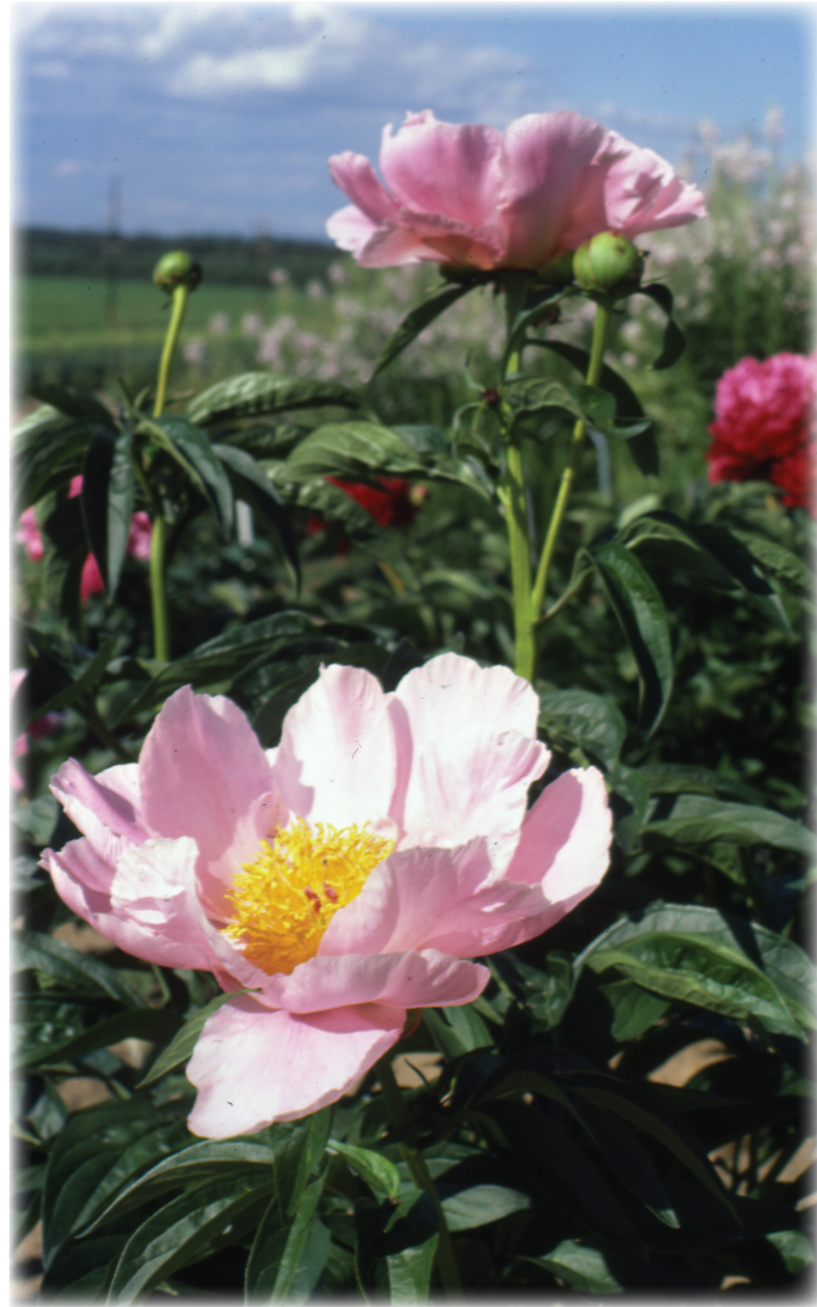
At top left, Paeonia lactiflora , Chinese Peony—photograph © 1999, Dr. Nick Kurzenko. Above, pink single blossoms of the domestic peony, a variety called Sea Shell —2001, Georgeson Botanical Garden Collection.

Peonies belong to the family Paeoniaceae and the genus Paeonia , within which there are a number of species and many cultivars. Both herbaceous and tree peonies are perennials, but tree peonies, which grow to eye level on woody stems with few branches, are not used for cut flowers. The more commonly grown herbaceous peony is a bushy plant, with green, pink, or red stems that grow two to four feet tall and turn green by the time they are cut down in the fall. Each cultivar has leaves a particular shade of green, with shapes ranging from broad to grass-like. Flower colors are white, yellow, cream, pink, rose, and deep red. Peonies are grouped into types according to the petal shape: single, Japanese, anemone, semidouble, bomb, and double. After winter, the plant emerges as dark red shoot that in just a few weeks will become a