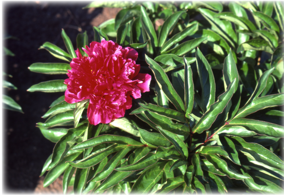
Rosenfeld peony blossom—Georgeson Botanical Garden Collection.

Carolina, 45 cm; and in the upper Midwest states, 60–90cm, according to Stimart. The first-year stem length in the trials averaged 46 + 12 cm and ranged from 0.3 cm to 63 cm.