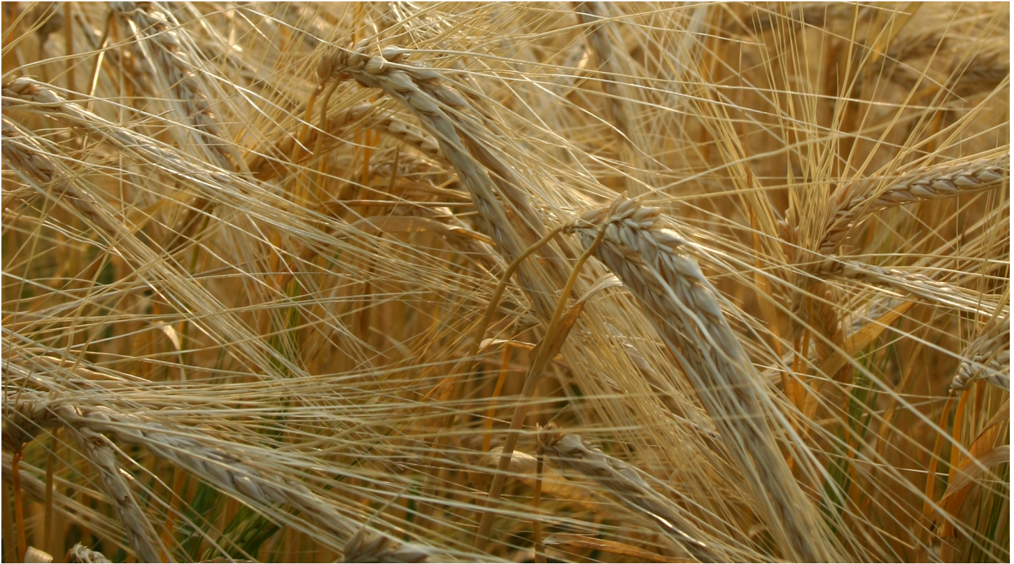
'Sunshine' hulless barley.

Inc. in Delta Junction, Alaska. It is a cross between the six-rowed Alaska cultivar 'Lidal' and the early-maturing, six-rowed Swedish cultivar 'Edda'. The average date of maturity for 'Svendal' is around July 26, about one day earlier than the average date of maturity for 'Otal'. Average yields are around 3,152 lbs/acre or 66 bu/acre, slightly less than 'Otal' yields. Test weights are lower than average at 47 lbs/bu. 'Svendal' has better lodging resistance than 'Otal'. To locate seed sources, contact Alamasu, Inc.