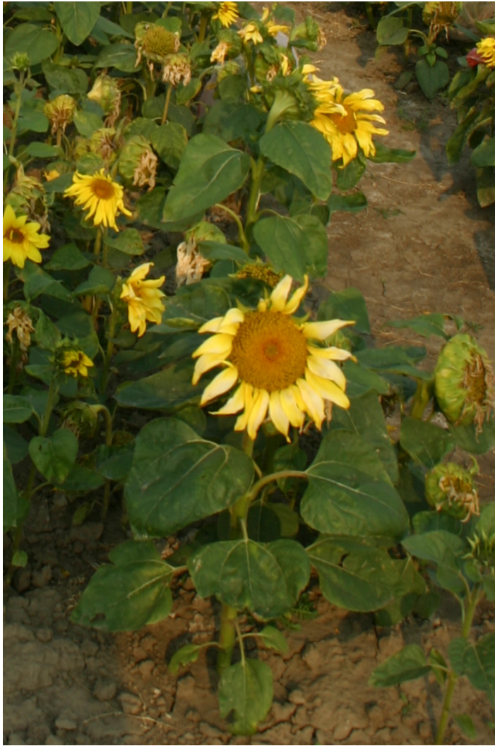
'Midnight Sun-flower' oilseed sunflower, in fields at the Fairbanks Experiment Farm.

seeds were hand-threshed, cleaned, and planted in test plots the following season. This process has been repeated every year since then. Since 'Sunwheat 103' is a hybrid semi-dwarf sunwheat, there was considerable variation in the following years' crops. However, continued selection for early maturity and high seed yields has resulted in an increasingly uniform, open-pollinated dwarf sunflower that closely resembles the Canadian Sunola varieties. To date, the plants are quite dwarf, averaging 20 to 24 inches tall and with head diameters of close to six inches. It matures two to three weeks earlier than 'Sunwheat 103' and four to five weeks earlier than common sunflowers. The average date of maturity for 'Midnight Sun-flower' is around July 28. Average yields are around 1,373 lbs/acre or 55 bu/acre for seed and 45 gal/acre of oil (hot-press extraction only). Test weights are slightly lower than average at 24 lbs/bu. Because of the plant's smaller size, planting is similar to Sunola, with about 60,000 plants per acre. This results in yields equal to those of 'Sunwheat 103'. However, because this is an open-pollinated crop, there is still some variability among plants. To locate seed sources, contact the AFES Fairbanks Experiment Farm.