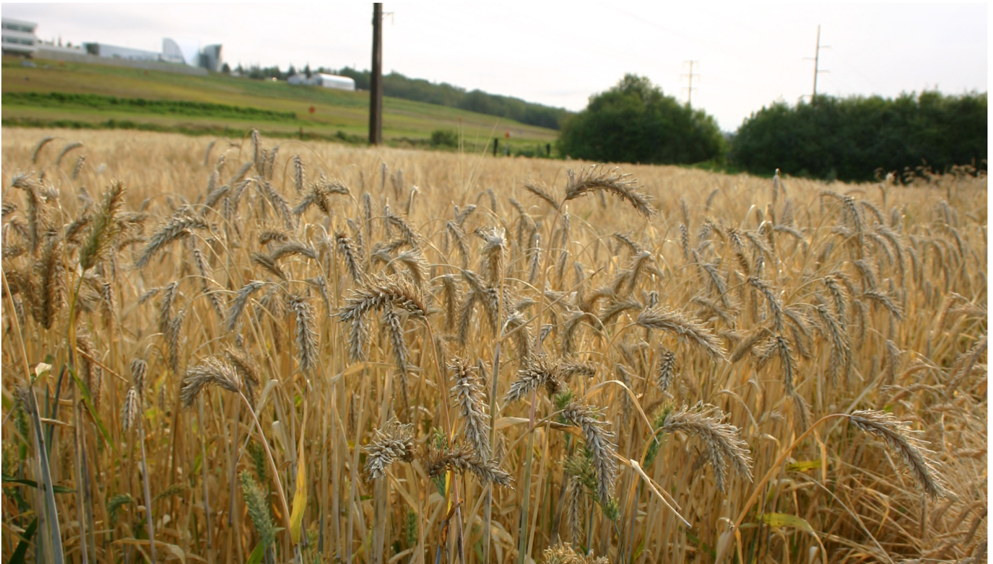
'Weal' forage barley at the Fairbanks Experiment Farm (note the hooded awns).