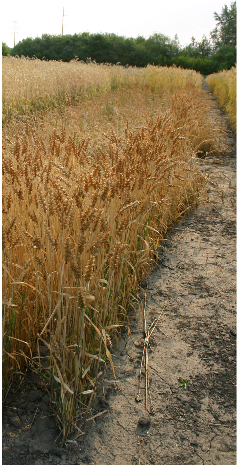
‘Ingal’ red spring wheat growing at the Fairbanks Experiment Farm.

‘ NOGAL ’ is an early-maturing, mid-tall, stiff-strawed, red-glumed, red-kerneled, awned, hard red spring wheat (Canadian hard red spring bread wheat)