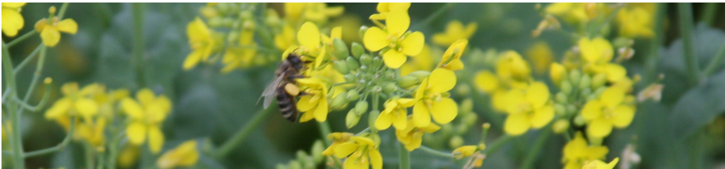
Top: Cow moose browsing in experimental fields August 4, 2011 in Delta. In the foreground is barley, and from left to right are wheat, oats (where the cow is standing), and field peas. Behind her are rows of potatoes.