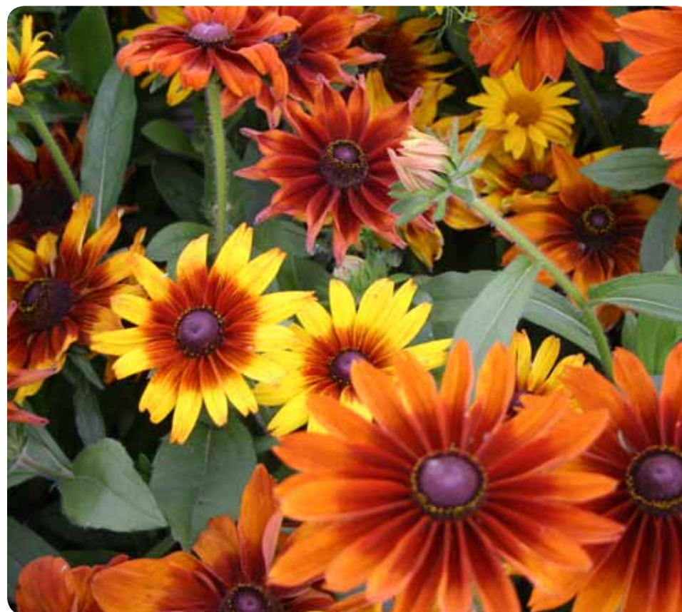
Rudbeckia hirta cv. Cappuccino growing at the Georgeson Botanical Garden.

The University of Alaska Fairbanks is accredited by the Commission on Colleges and Universities of the Northwest Association of Schools and Colleges. UAF is an affirmative action/equal opportunity employer and educational institution.