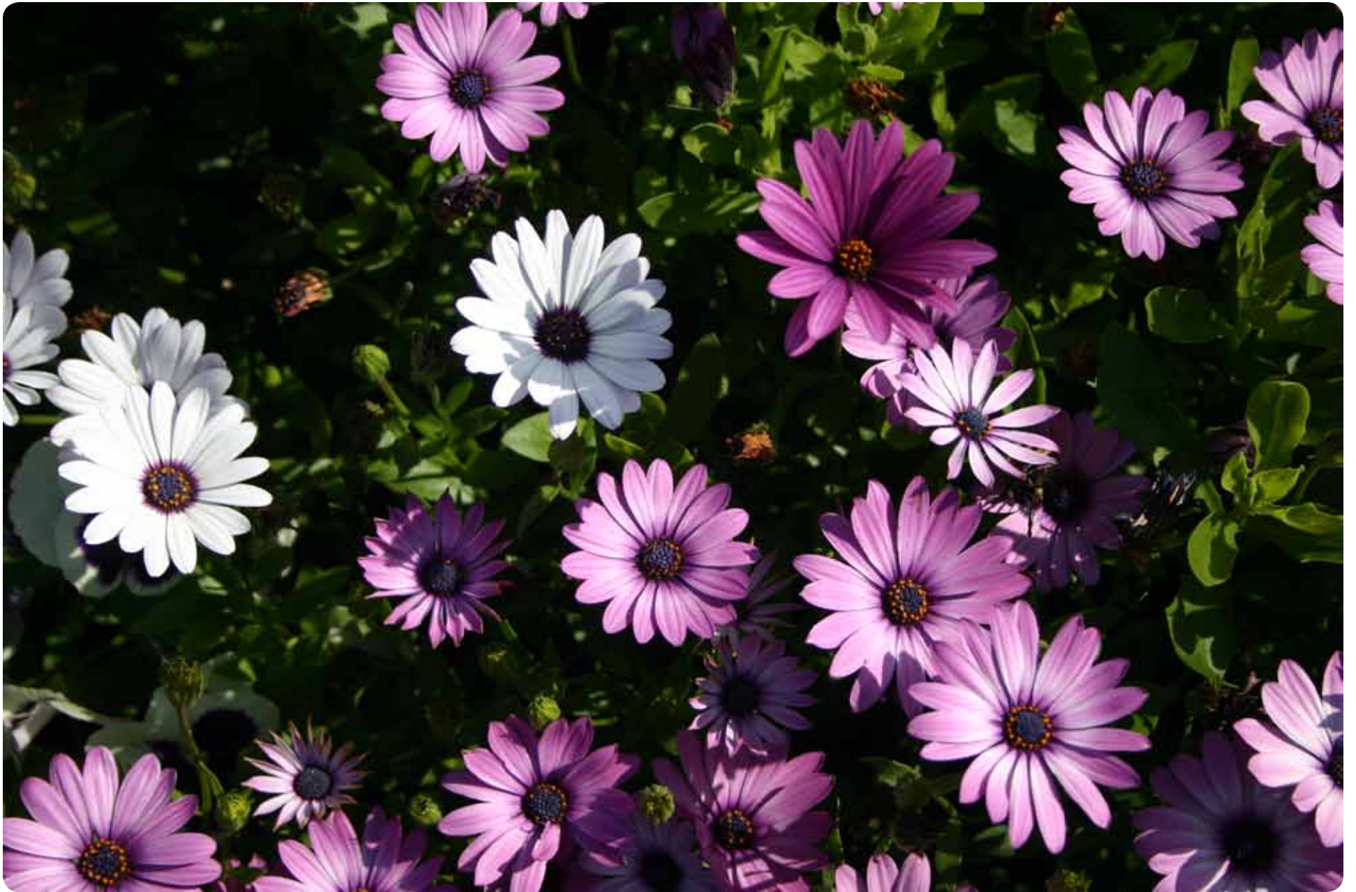
Osteospermum ecklonis cv. Ballade Mix growing at the Georgeson Botanical Garden.