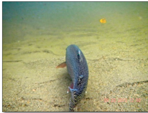
A radiotagged rainbow trout from Willow Creek, AK, upon release.

Native inland resident rainbow trout are an important ecological and fishery resource in the Susitna River basin, Alaska, yet the distribution of their seasonal habitats is poorly understood. Variable spawning site fidelity, long-range movements, and potential land use and climate change effects add to the uncertainty surrounding conservation and management of this species. The Susitna River basin is transected by one of the busiest road corridors in Alaska, the Parks Highway. As a result, areas within this region are among the most developed in the state. Projected land-use changes will likely result in degraded critical habitats for salmon and resident species. The primary objective of this project is to determine the distribution of seasonal habitats for potamodromous rainbow trout in the Willow Creek watershed, Southcentral Alaska. Seasonal habitat use by rainbow trout will be assessed using radiotelemetry and linked to habitat characteristics (physical habitat, water temperature, and flow). Habitat availability will be assessed by spatially-continuous mapping of geomorphic channel types and water temperature metrics, and will be conducted during summer 2013. Habitat use will be quantified by