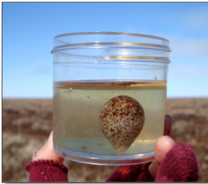
Floating shorebird eggs allows researchers to age the egg and calculate nest initiation date.

important for understanding population trends. We have little data on conditions encountered outside of the breeding season or how these conditions carry over to influence individual fitness and population dynamics. Cape Krusenstern National Monument (CAKR) is important for breeding shorebirds, yet they spend nine months each year away from their breeding grounds. We are attempting to evaluate seasonal carry-over effects that may influence individual fitness and population dynamics. The objectives of this research are to (1) compare historic and contemporary data on shorebird communities to examine changes in species presence and abundance, habitat use, and phenology; and (2) understand the effects of ecological conditions outside of the breeding season on the subsequent reproductive success of individual shorebirds. I will compare historic data and data recently collected through the Arctic Shorebird Demographic Network. I will measure corticosterone present in winter-grown feathers and relate levels to nest initiation date, clutch and egg size, and hatching success. Field data are still being collected. This work can improve development of international, scientific-based strategies to manage arctic-breeding shorebirds.