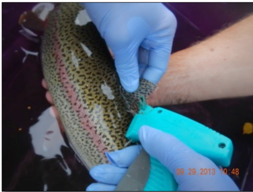
Floy-tagging a rainbow trout recently implanted with a radio tag in Willow Creek, AK.

In-Kind Support: Personnel, boats, logistics: ADFG Region 2