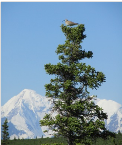
A Whimbrel found near Donnelly Dome with the Alaska Range in the background to the south.

Studies of Whimbrel breeding ecology are limited in North America, despite suspected population declines and an official designation as a species of conservation concern (U.S., Canada, and Alaska). The ecology and distribution of the species in Interior Alaska have been particularly understudied. This research addresses critical information gaps identified in conservation status reviews of Whimbrels including breeding distribution, habitat associations, and factors affecting breeding success. Our first objective was to establish benchmark metrics on the breeding ecology of a local population of Whimbrels at Kanuti National Wildlife Refuge for 2011–2012.