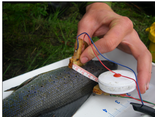
Measuring electrical resistance and reactance of an Arctic grayling from Julius Creek, AK.

Relatively little information is available on how the energetic status of salmonids fluctuates across life stages, seasons, and environments at the individual level. Much of this uncertainty results from the relative difficulty (i.e., expense) of obtaining precise estimates of proximate composition (PC). Moreover, PC analysis is expensive, time consuming, lethal, and not practical for repeated measures, field applications, or large numbers of individuals. Recent advancements in bioelectrical impedance analysis (BIA) show promise in developing precise non-lethal estimates of individual fish condition. Development of rapid, precise, and non-lethal methods of estimating energetic status are critical for successful fisheries management and for contributing to our understanding of bioenergetics and the flow of energy through populations, communities, and ecosystems. The main objective of this research is to build and validate BIA models for Arctic grayling. Grayling will be collected from streams and lakes near Fairbanks, Alaska, sacrificed, weighed, measured, and BIA measures of resistance and reactance recorded. Samples will be