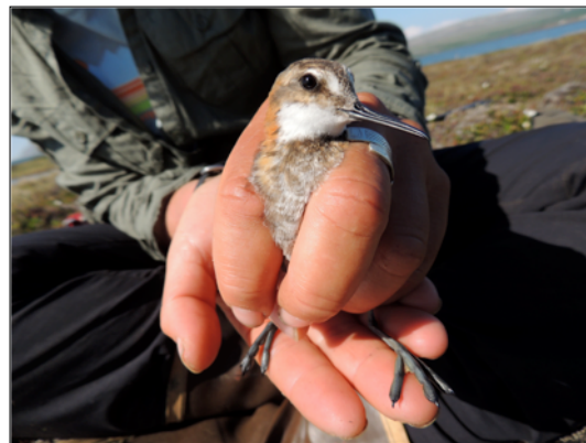
A researcher shows off the lobed toes of a Red-necked Phalarope.