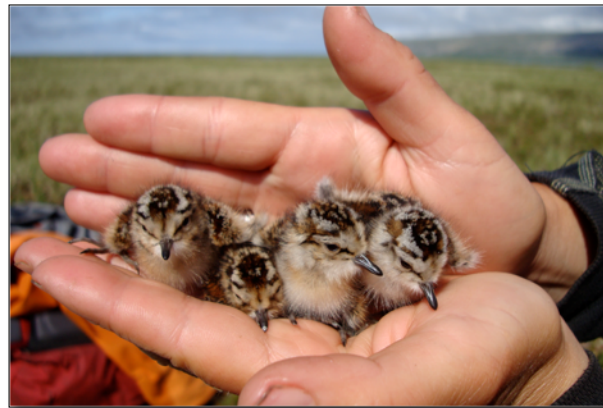
A researcher holds four day-old semipalmated chicks. They will fly thousands of miles to their wintering grounds by the end of summer.