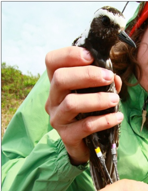
During the 2013 field season in Nome, we banded 37 adult Golden Plovers (both American and Pacific Golden Plovers). While tracking chicks, we used individually marked adults to identify broods throughout the brood-rearing period.

Funding Agency: Alaska Science Center, USGS (RWO 194)