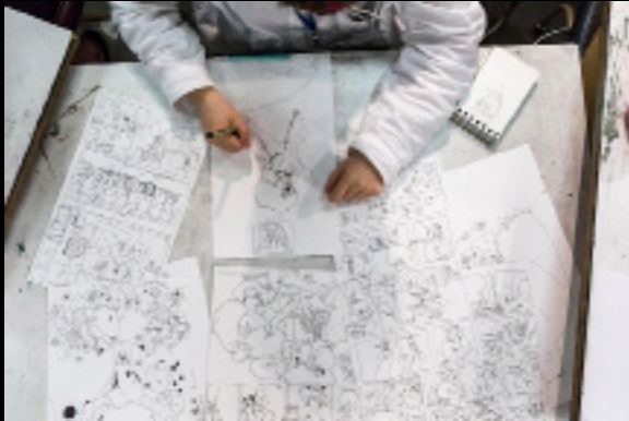
Cartooning student

Animation, Cartooning, Ceramics, Computer Art, Fashion Design, Photography, Drawing and Design, Metalsmithing, Painting, Printmaking and Sculpture & 3D Design.