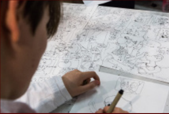
VAA student creating a sequential cartoon

If tuition and fees are not paid in full by May 24, the registration deposit will be absorbed and the student's enrollment in the Academy will be voided.