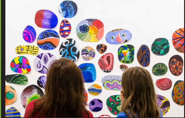
Painting students' art work