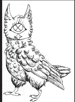
Drawing by Shia W.