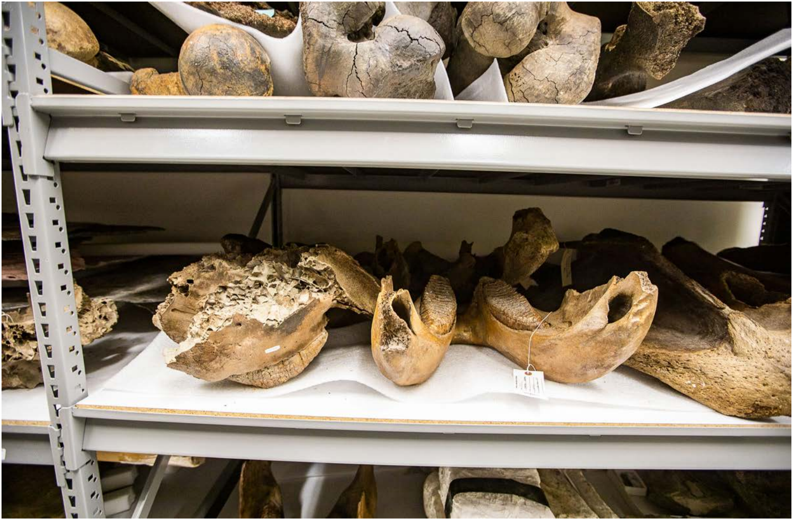
Photo caption: A vast collection of mammoth fossils, including a jawbone with teeth, are stored in the Collection Range at the UA Museum of the North.

A bowl marked “walrus teeth” sits on a small table, and sure enough, it’s full of massive, jagged molars. Bird skeletons, trays of insects, caribou skulls – just about any random piece of an Alaska species seems to be around somewhere. Wooller and Druckenmiller were there for the mammoths, shuffling through more than 100 gigantic tusks stashed above the high shelves in the middle of the room.