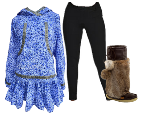
3 local community engagement coordinator