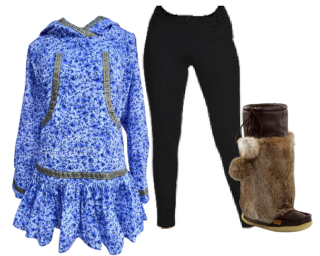
3 local community engagement coordinator