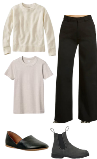
2 Snappy casual / business casual you can work in if needed, closed toed shoes