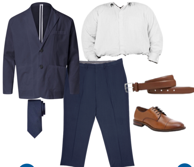
5 government, legal, or finance position