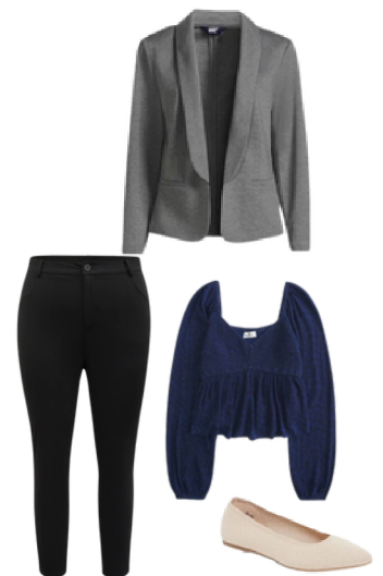
6 nonprofit organization administrative assistant