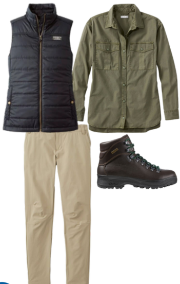
4 park ranger or conservationist