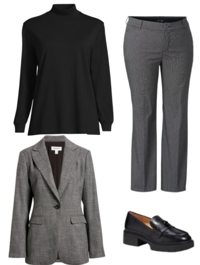
3 More formal, traditional interview attire