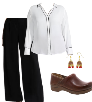
2 office administration or other “office” worker