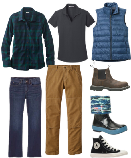
1 On-the-job-inspired work attire, clean, sturdy clothes and shoes

Below are 3 examples of outfits that women in a variety of fields have worn to job interviews.