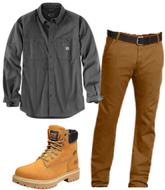
1 construction or landscaping worker

Here are 6 examples of sample interview outfits that could be appropriate for more casual to more “professional” standards across a variety of industries: