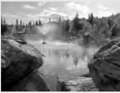
Outdoor Rock Lake