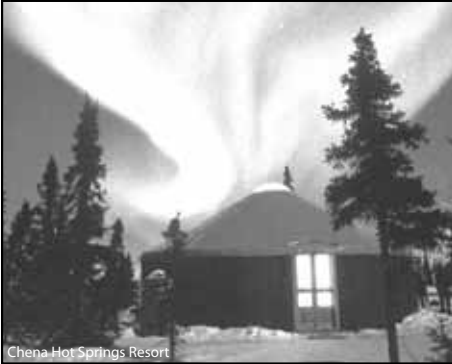
Chena Hot Springs Resort