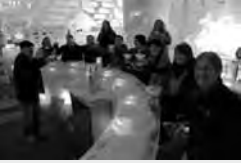
Enjoying the Ice Bar