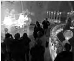
Aurora Ice Museum