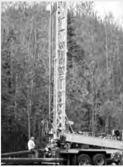
Drilling 3,000 ft Well