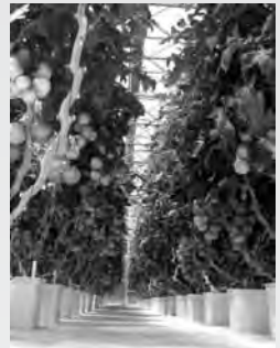
"Chena Fresh" Tomatoes