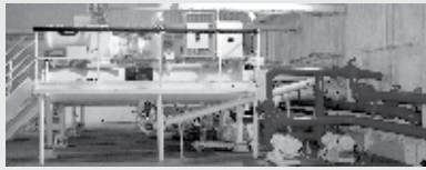
Organic Rankine Cycle (ORC) Geothermal Power Plant