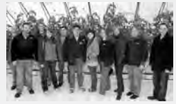
Visit to "Chena Fresh" Greenhouses