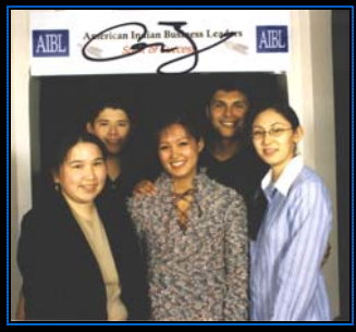
SOM NABL officers with Adam Beach, co-star with Nicolas Cage in "Windtalkers," at the recent American Indian Business Leaders Conference in Seattle, Washington.