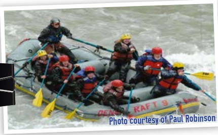
Employees at Robinson & Associates try their hand at river rafting.