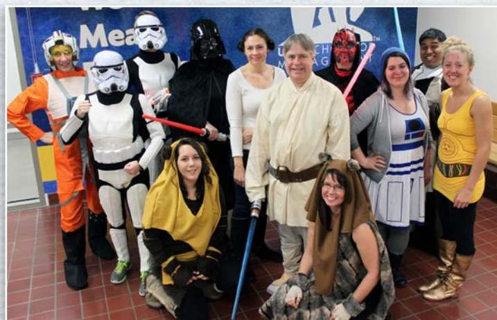
The SOM Staff says... May the Force Be With You!