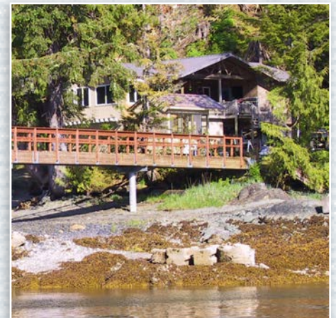
Old float house revamped outside of Ketchikan