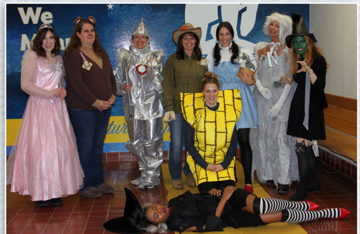
Follow the SOM Staff down the Yellow Brick Road! Halloween, 2016