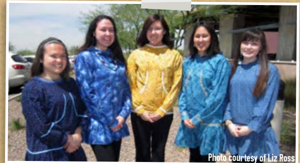
NABL students at the 2013 American Indian Business Leaders conference in Scottsdale, Arizona.

Next year, this student organization plans to help homeless youth in the Fairbanks area and provide them with materials they need to be more comfortable.