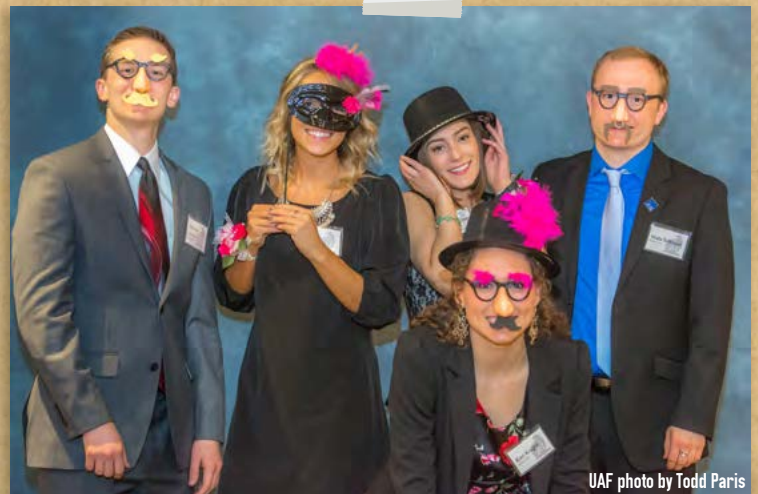
A few of the many students involved in organizing the Business Leader of the Year event.

SOM is one of only 178 colleges and universities in the world to hold the prestigious Association to Advance Collegiate Schools of Business (AACSB) accreditation for both the School of Management and its Accounting program.