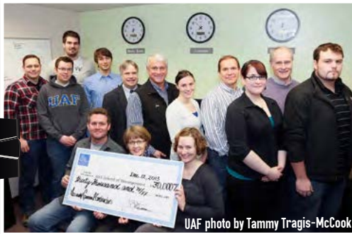
Associated General Contractors gives $30,000 to the Student Investment Fund.

Associated General Contractors (AGC) Fairbanks Task Force gave $30,000 to SOM for the Student Investment Fund (SIF) to be invested and start a new scholarship for business students. Eventually the AGC gift will generate enough return on investment to completely fund the scholarship for the future.