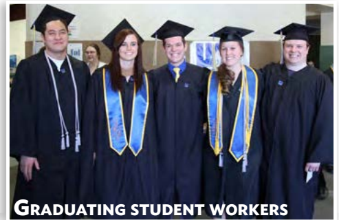
GRADUATING STUDENT WORKERS