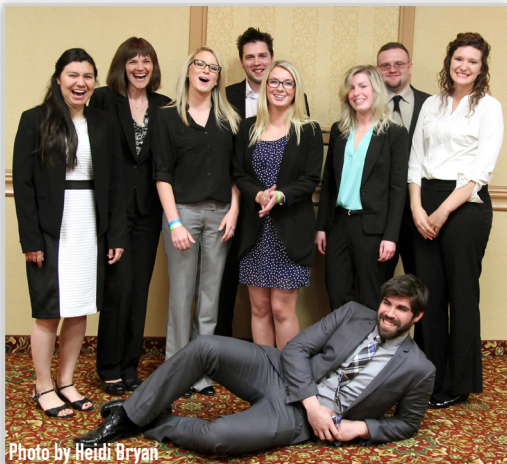
GAAP Officers for 2015-16

GAAP had another great year of activities, starting with a Professional Development Day at the Westmark Hotel; about 55 people attended this event, including approximately 30 students. GAAP also held the 3 rd Annual Alaska Native Corporation Seminar. At the end of the year, GAAP once again provided a number of Voluntary Income Tax Assistance (VITA) sessions, where they helped community members fill out and file their tax returns.