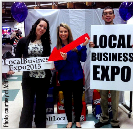
ASB Members volunteer at the Small Business Expo