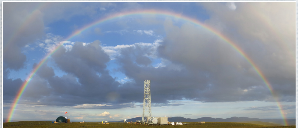
GCI's Harvey tower site with a double rainbow

It's incredibly important to support the institutions that develop and prepare the individuals who will make up our future business workforce. By investing in UAF's School of Management, you are also investing in the next generation of business and community leaders, those who will play an immense role in the future development of Alaska's economy and therefore the well-being of all Alaskans.