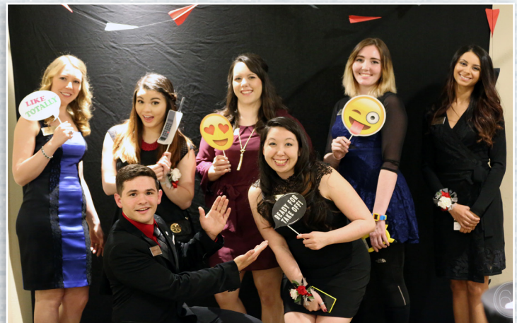
The student Decorating Committee members at the Business Leader of the Year banquet