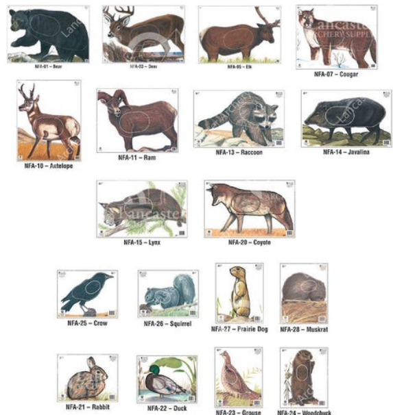
March Novelty Animal