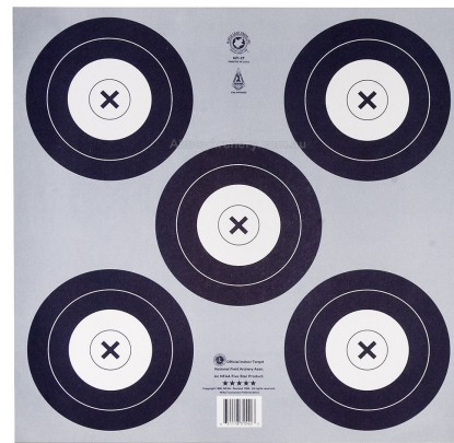
February 35cm NFAA Field