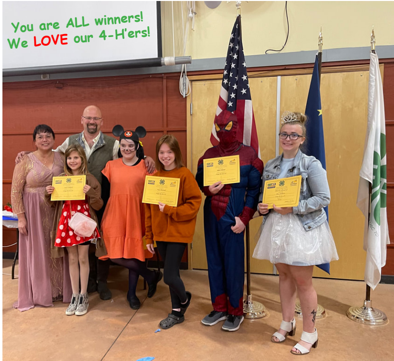
Tanana District 4-H families had fun donning their favorite Disney-themed costumes for this year's Achievement Night. For awards listing and more photos of the enchanted evening, see pages 4-5.