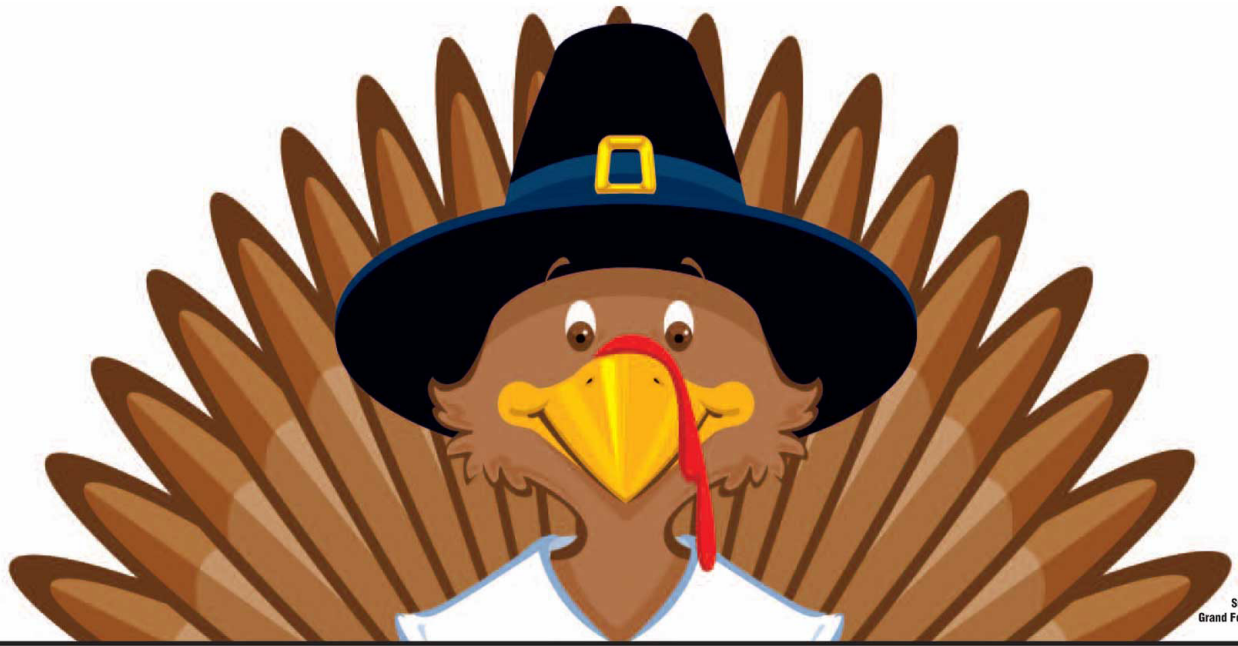
Created by Sue Lindlauf Grand Forks Herald 2010