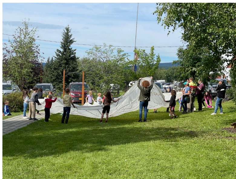
Cloverbud Day Camp shenanigans! The littles enjoy games with a giant parachute under sunny skies in July.