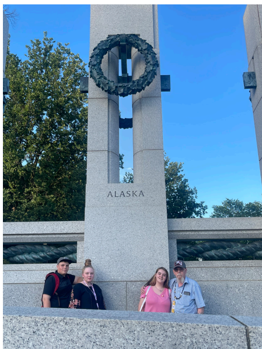
Alaska youth at the World War II Memorial during their June trip to Citizenship Washington Focus.