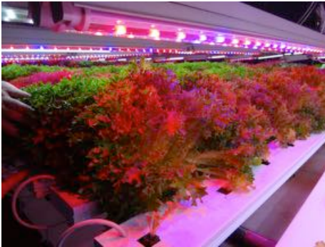
Growing greens with LED lights in the greenhouse at Chena Hot Springs—Photo © Ken Meter, 2014