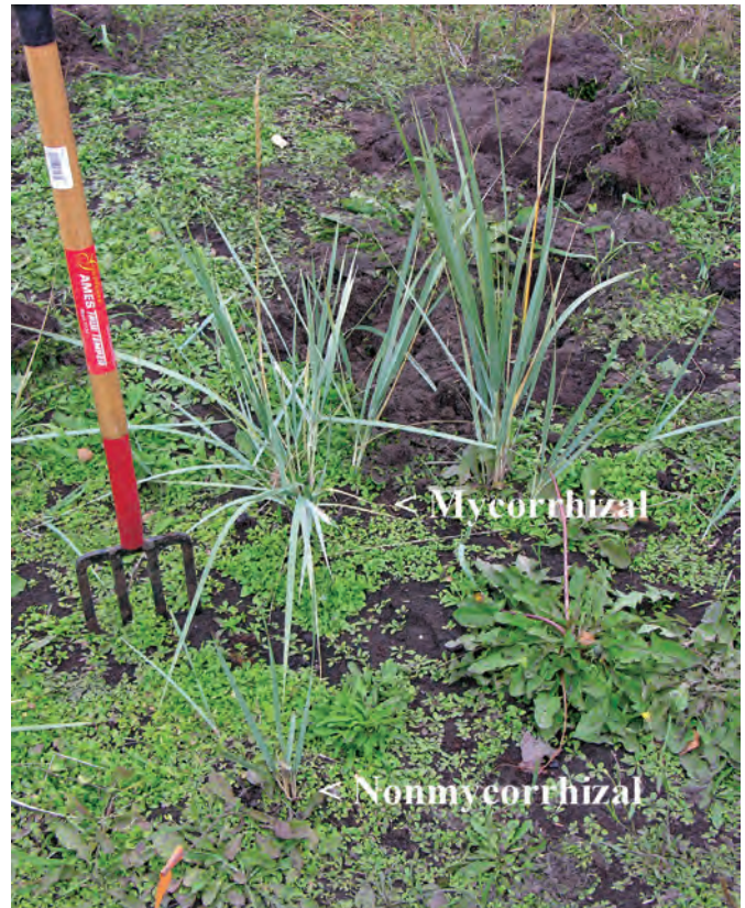
'Reeve' beach wildrye plants inoculated with mycorrhizal fungi showed more vigorous growth than those not inoculated with mycorrhizal fungi.

actually stimulate mycorrhizae colonization by eliminating fungal competitors. Most herbicides and insecticides applied at the recommended rate have little impact on the mycorrhizal population.