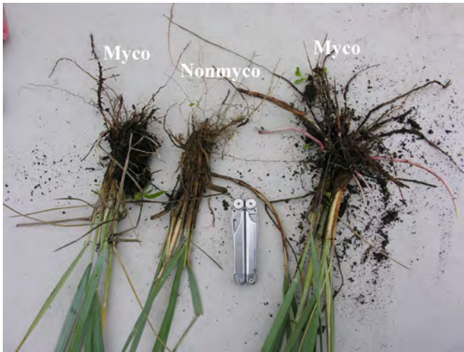
Root balls from non-inoculated samples of 'Reeve' beach wildrye plants were smaller than root balls from plants inoculated with mycorrhizal fungi.

However, the mycorrhizae association has been observed in rice paddies, suggesting that at least some species of fungus may work in a low oxygen environment.