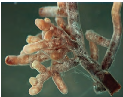
Ectomycorrhizal short roots (root tip mycelia of the Amanita” type).

Over 95 percent of the plant families are known to have some form of mycorrhizal associations, particularly in undisturbed conditions. In fact, this relationship is so common, evidence of its existence has been found in fossils dating back 460 million years. Understanding how mycorrhizae operate in natural systems may be beneficial to improving the quality of plants in our gardens and landscapes while minimizing the need for fertilizer and water.