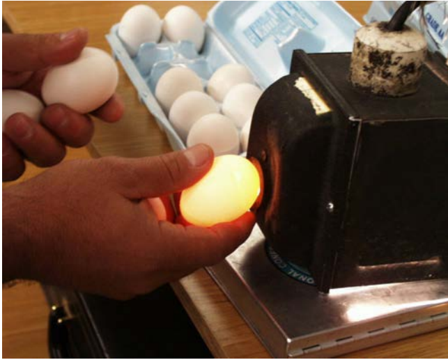
Candling an egg.

Note on candling dark brown eggs: In order to properly candle dark brown eggs, you will need a candling light with a magnifier specifically made for eggs. These can be purchased through a poultry supply company.