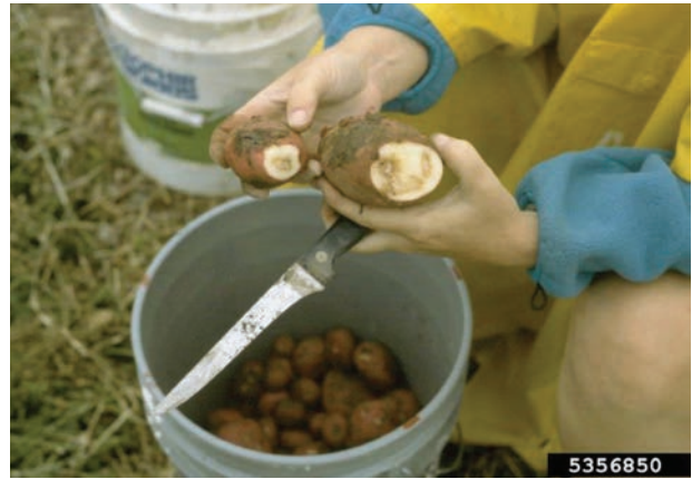
Potato tubers cut open to display symptoms of bacterial ring rot.

two steps — washing and disinfecting — work together. Almost all disinfectants are inactivated by dirt and organic matter; pressure washing cleans the equipment and lets the disinfectant do its job.