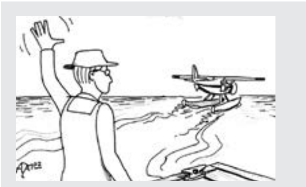
I only want to go to places where people want me. It's horrible paying a lot of money to be trapped in a place that doesn't want you there.

Are you and your neighbors okay with that?