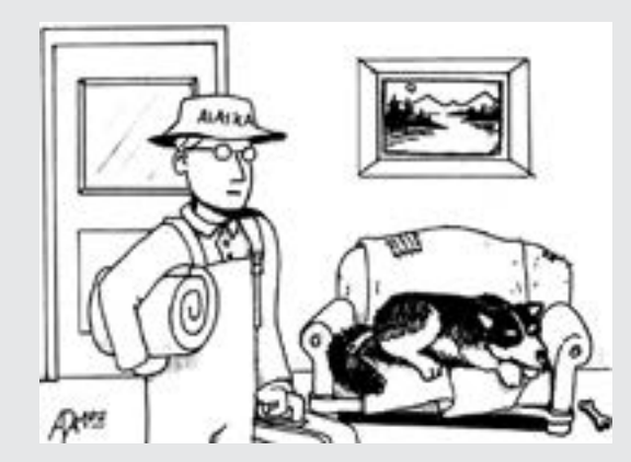
I would love to be able to experience an authentic rural Alaska experience. But I want to make sure I am drinking safe water and eating healthy food. And if there's no ATM, I have to remember to bring enough cash! I wouldn't mind sleeping in a school gym, as long as there was a cot or a comfortable sleeping pad.

Do you have places for people to stay? To eat? To fill their time?