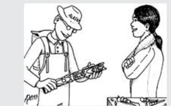
I prefer local businesses. I think they provide unique and more personal attention, which gives me much better memories!

Tourism is different for the customers, too, who must make their purchase sight unseen. Therefore, it is vital to make sure the tourists know what to expect.