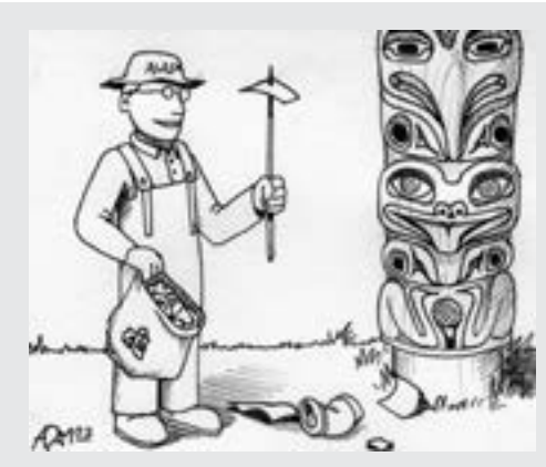
I hate bad surprises and I want to be welcome and a good influence on the communities where I visit.

It may take longer, but it is worth it to ensure your community is one that controls and will benefit from tourism and not vice versa.