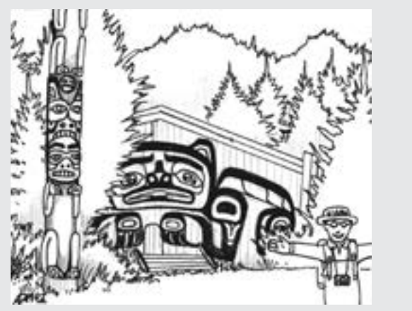
If I were coming into your area to take a fishing trip, I would love to experience the local culture, too.

You may want to say, "This is like going camping. Bring everything you would need on a camping trip. <u>Except</u> this is the tundra, so you won't have a tree to go behind to do your business."