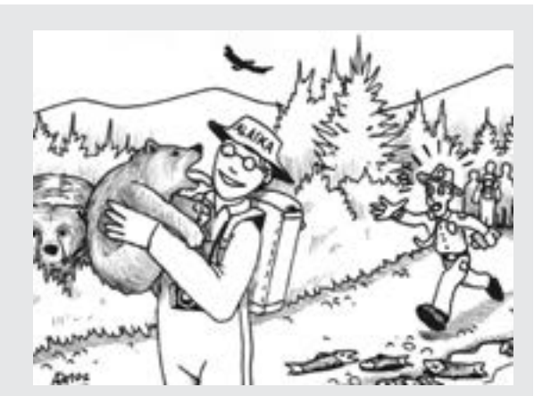
I want to make sure to respect the land and wildlife while I am in Alaska. And I want my guide or host to teach me what to do as part of his or her service.

The money that goes to the community might be as low as 10 percent or less if you go for a quantity experience such as busloads of tourists brought in by an outside firm.