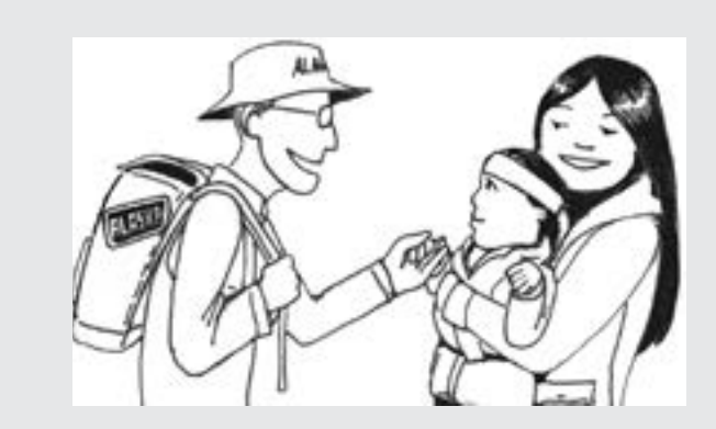
When I see a young person from a proud and interesting culture, I always make sure to tell them how cool I think they are.

Tourism can also provide employment, especially for young people. With proper planning, village residents can be employed providing tourists with subsistence and cultural information, travel help and with other personal needs.