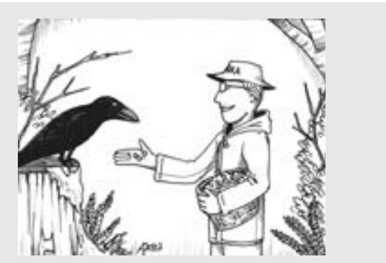
I have a stressful life in the Lower 48 and the idea of working with friendly local people in a beautiful natural setting really appeals to me. I'd love to pick berries and make new friends!

Tourists from the Lower 48 and international tourists may be interested in many things rural Alaska has to offer. A tourism business could be wildlife-based, such as a wilderness guide for hunters or photographers. Other businesses could be based on arts and crafts, cultural performances or nearby geographic features, such as volcanos or rivers.