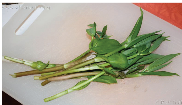
Wild Cucumber (Streptopus amplexifolius) ready to be chopped up for salad.