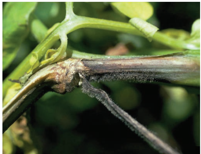
Late blight disease on potato vine.