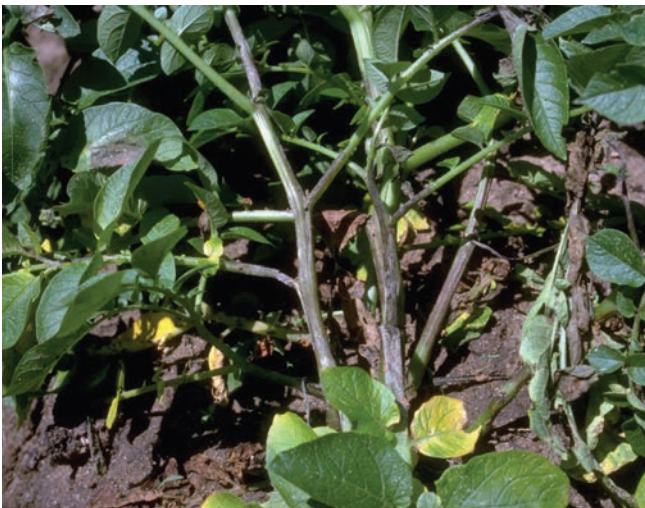
Late blight disease on potato vines.