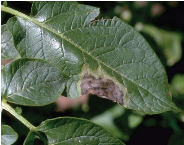
Late blight lesion on potato leaf.