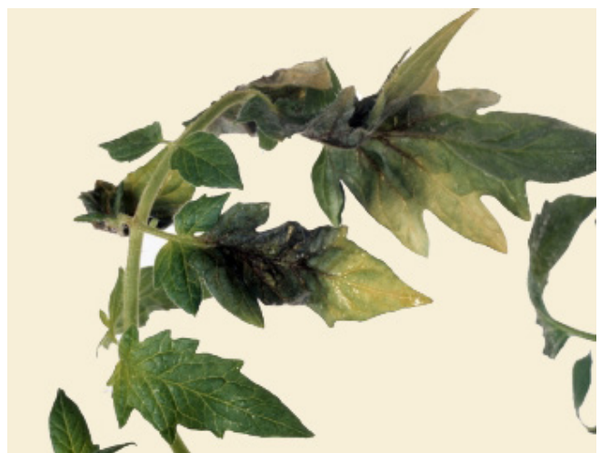
Late blight lesion on tomato leaf.