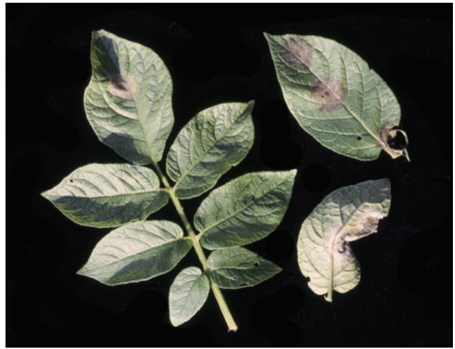
Late blight lesions on potato leaves.