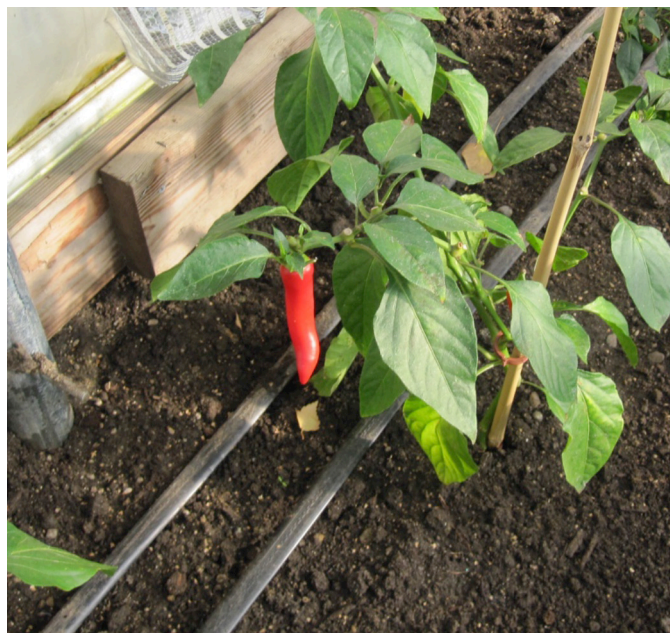
Two lines of drip tape in a row of specialty peppers

The drip irrigation line is placed under the plastic mulch as close to the transplant holes as possible. The drip line should extend beyond the plastic mulch to facilitate water hookup and shut-off. Because the soil is covered with plastic mulch, it is more difficult