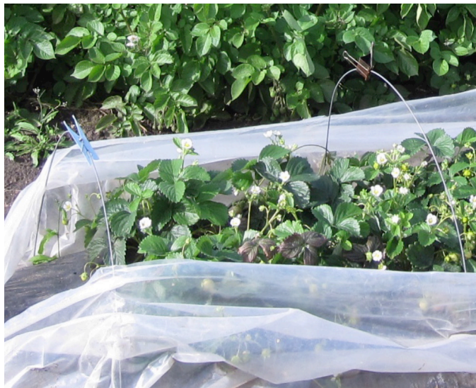
Two-piece clear plastic row covers. The two plastic strips have been lowered for ventilation.

Wire hoops are used to support the row cover. The plastic row cover is stretched over the hoops and secured at the outside edges with soil to form low tunnels over the crop row. If a 4-foot-wide bed is used, the wire pieces should be 6 feet in length and spaced every 4 to 5 feet along the row. The wire should be 9-gauge or larger diameter. The wire hoops are placed into the soil to form hoops that are 16 to 20 inches high for maximum strength and wind protection. A low tunnel with no sags or folds in the plastic and the edges buried with soil on each side of the bed will provide maximum protection from wind. At the ends of the bed, the wire hoops are doubled as the row cover exerts the most pressure at these points. When the growing transplants reach the top or sides of the low tunnel, the cover is cut in sections to allow additional space for growth. As the plants continue to grow, the low tunnels are removed.