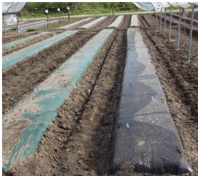
Raised beds covered with black plastic mulch and ready for planting. Bed on the right is covered with black plastic mulch and bed on left is covered with wave-length selective IRT (infra-red transmitting) mulch.

Black plastic is popular because the exclusion of light prevents weeds from growing underneath it. The disadvantage is that black plastic does not warm the soil as much as clear or wavelength-selective mulches. Black plastic absorbs solar radiation and transmits the energy through conduction to the soil. A large portion of the radiant energy falling on black plastic is re-radiated or transferred to the surrounding air through convection. Clear plastic, on the other hand, allows transmission of solar radiation and energy to the soil through the greenhouse effect. For black plastic to be effective, it needs to be in contact with