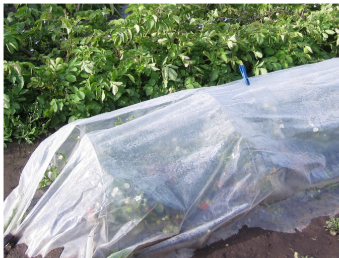
Two-piece clear plastic row covers. The two plastic strips have been pulled up and secured with cloth pins at the top of the hoops.

Clear polyethylene plastic without perforations or slits quickly heats up in sunlight. To allow opportunities for ventilation, a design with two pieces of plastic row cover is sometimes used. If the bed is 4 feet wide, two 3-foot-wide plastic pieces the length of the bed are prepared. The plastic pieces are secured with soil along each side of the bed. The wire hoops are installed across the bed inside the secured row cover pieces. After the bed has been planted, the two plastic pieces are pulled up and secured at the top of the hoops with clothespins or small metal spring clamps. The design allows the plastic to be opened