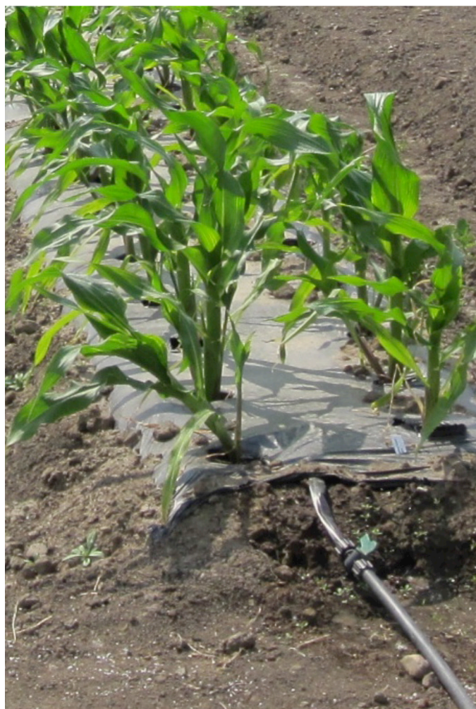
Drip irrigation tape under plastic mulch with a shut-off valve

Approximately 35 percent of the total nitrogen and potassium and all of the phosphorous may be applied prior to laying the mulch if fertilizer will also be provided through the drip irrigation (fertigation). If fertigation is not planned, all fertilizer should be applied before the mulch is installed. The plants will have fast initial growth with a starter solution high