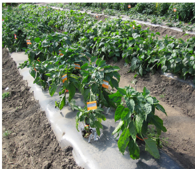
Bell peppers grown in raised beds covered with black plastic mulch

The floating row cover material is placed directly over several beds or rows of vegetables without wires or other support. It is kept in place with plastic or metal wire garden staples pushed into the ground. The floating row cover material can also be used as a low tunnel over vegetable transplants. There are several brands and types of floating row covers, including Reemay, a spun-bonded polyester; Agronet, an ultraviolet-stabilized polypropylene and polyamide film/net; Agribon, a spun-bonded polypropylene fabric; and Agryl P17, a spun-bonded polypropylene fabric.