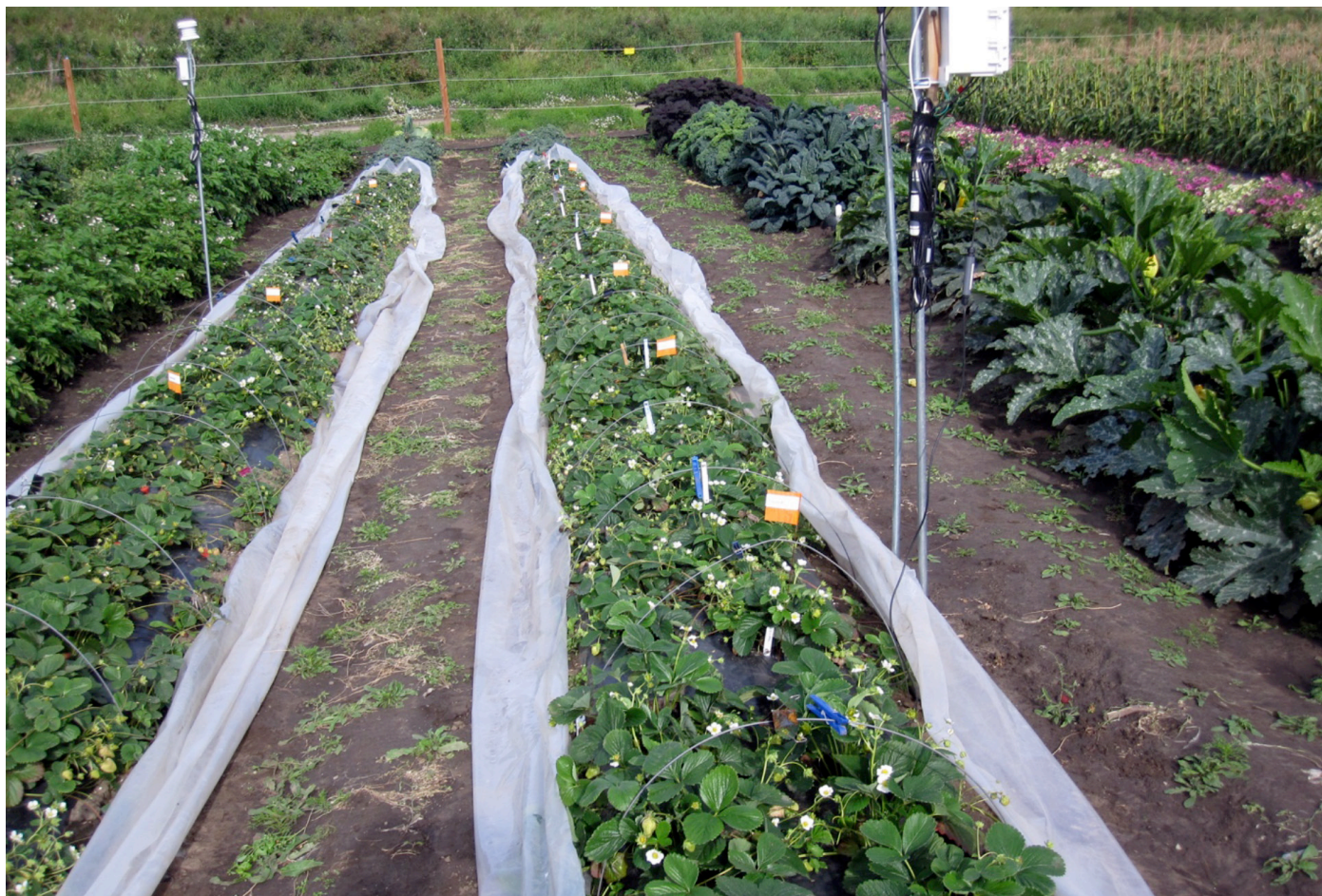
Two-piece clear plastic row covers. The two plastic strips have been lowered for ventilation.

Beds can be constructed in a variety of widths and heights. For vegetable production, beds that are 24 to 30 inches wide and 4 to 6 inches high with gently sloping sides work well. The beds should be on 4- to 6-foot centers depending on the crop management approach. Enough spacing between vegetable beds is needed to allow the plastic mulch to be secured on each side and for foot traffic and the use of equipment for weed control.