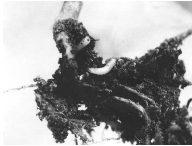
Figure 6. Root maggot larvae feeding on the root of a mustard plant.

Sanitation — This is a very important procedure that can be done easily by the home gardener. Do not abandon root maggot infested crops. They harbor countless numbers of larvae, which, if allowed to mature, will be the source of next year's infestation. If you have given up on a crop for any reason (root maggot infestation or weed competition, etc.), remove the crop and destroy it. As you harvest stem crucifers, remove the root system. This is especially important in earlier-maturing varieties. Keep the garden and adjacent areas free of weedy mustards and other host plants.