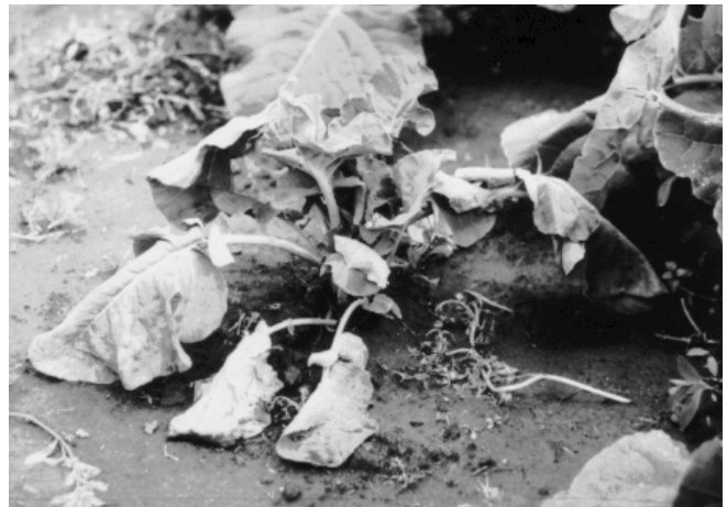
Figure 2. Broccoli plant showing symptoms of root maggot damage.

damaged. Feeding tunnels predispose the plant to infection by soft-rot bacteria and to secondary infestation by springtails and thrips.