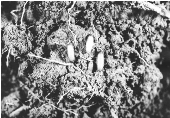
Figure 3. Root maggot pupae (about ¼ inch in length) in soil.

All species have basically the same life cycle. They overwinter as pupae (Figure 3) in the soil at a depth of one to five inches. As the soil warms in the spring, the root maggots complete pupal development and emerge as adults. The date of adult emergence varies from year to year and region to region, depending on the soil temperature regime, but occurs very early in the growing season. Emergence continues for four to eight weeks as the soil slowly warms at different depths. Following emergence, adults mate and lay eggs (Figure 5) at the bases of host plants at the soil surface, in cracks or under soil clods, or they may adhere to the plant stem. Egg laying begins two to seven days after the flies begin to emerge. Early in the season the flies appear to have a preference for larger plants, usually faster-growing varieties. More than 100 eggs can be laid on a single plant over a period of two days. Eggs