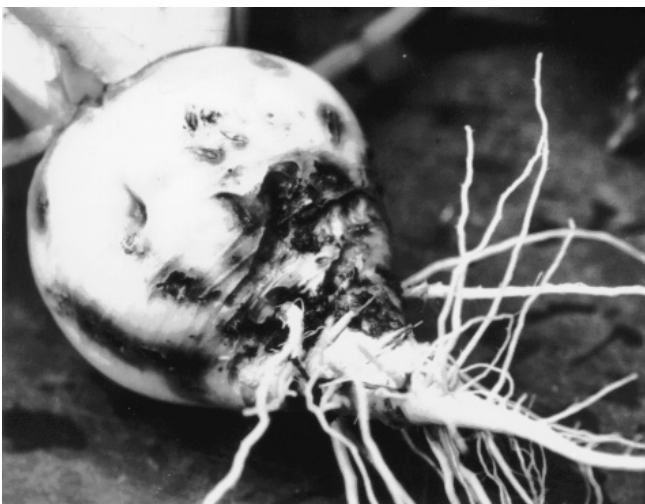
Figure 1. Damage to turnip caused by root maggot larvae. Note the scars of surface feeding and entrances to feeding tunnels within the root.

When root maggot larvae feed on root crops such as turnip, rutabaga and radish, they leave surface scars and feeding tunnels (Figure 1). Any feeding scars may render the produce unacceptable for market, but the home gardener can trim off lightly damaged portions if the extent of damage is not too great. However, the root is often severely