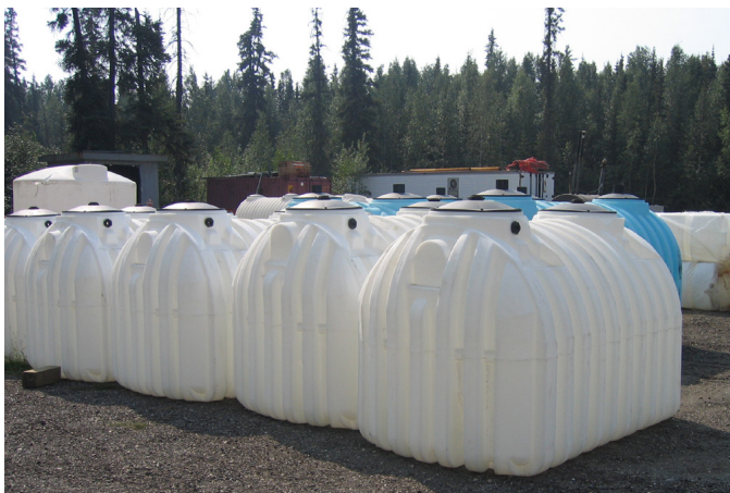
High-density polyethylene tanks

Figure 1 shows a useful feature suggested by Water Wagon, a Fairbanks water delivery company, that serves as a low-level water alarm. The standard pipe delivery port for a double-tap fitting is shown. A second double-tap port is included to provide for a second intake line into the home water system. The down pipe for the standard intake goes to within 10 inches of the bottom of the tank. When the water in the tank drops below this level, the normal supply runs out. The second line provides a reserve tank sim-