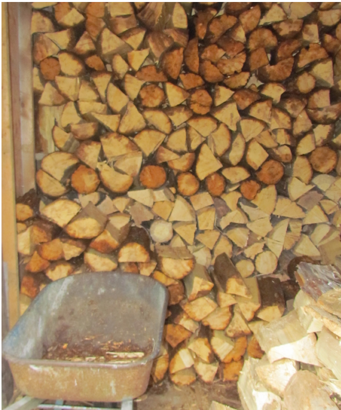
Split rounds of firewood more than once and stack them to begin drying.

Live winter-cut trees can have 40% or more moisture content. Seasoned dry firewood is less than 20% moisture content. To season firewood: Cut logs in firewood lengths; split each of those rounds more than once; stack the split wood just off the ground (on sticks, lumber, pallets, etc.); and separate stacks a couple of inches to let air circulate and allow drying.