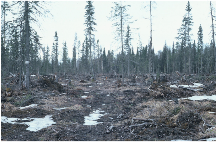
Site preparation suppresses competing vegetation and is important to natural regeneration as well as planting seedlings.