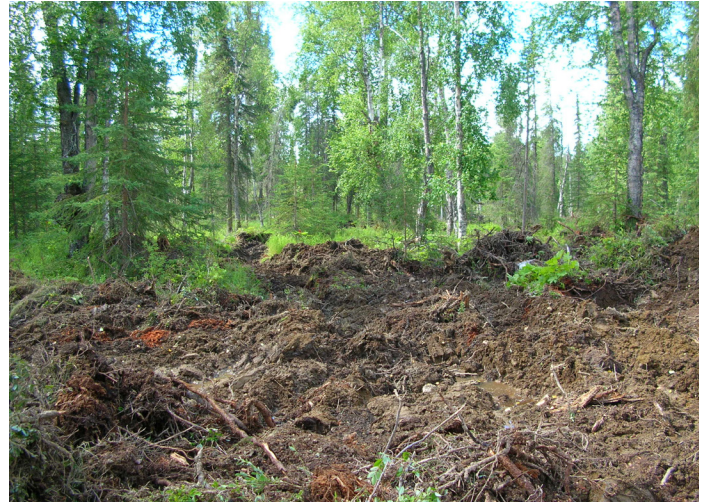
Site preparation prepares the site for planting and natural regeneration.

Prior to planting, most sites must be prepared for planting and able to sustain growth through maturity. Site preparation might include soil exposure, brush removal, or herbicide use, all of which is intended to