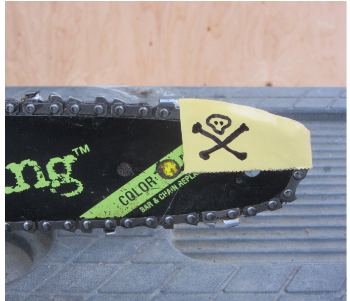
The top tip of the chainsaw bar is the kickback zone.

Warn others near you before felling a tree. Never leave a tree only partially cut down. This can kill someone later. Keep your chainsaw in top running condition. Use new, good gas that is properly mixed and make sure the gas and oil are full before cutting a tree down. Only use a sharp chain when cutting trees and bucking firewood. Do maintenance prior to any field cutting day for safety and efficiency.