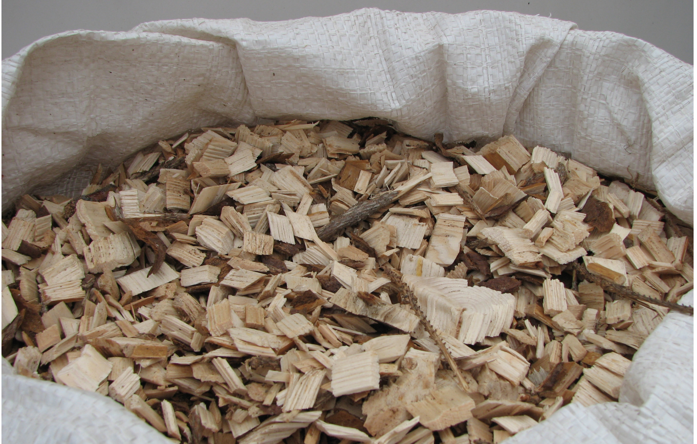
These wood chips could be biomass turned into insulation board.