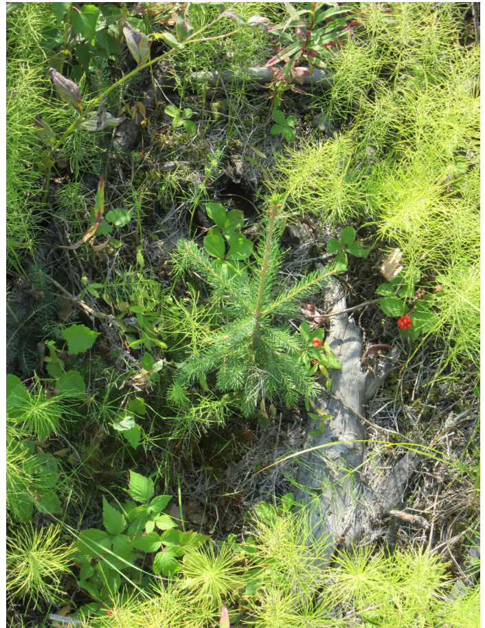
Planted seedlings become the future forest.

When seedlings are received, they need to be properly stored until planting, and the labor to handle and plant them must be secured for the proper window of time. Planted seedlings may need tending or watering to survive.