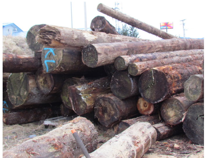
Firewood from the forest is green with a 40% moisture content or more.