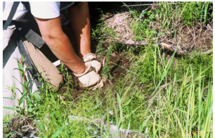
Tree planting is an aid to successful forest regeneration.

reduce vegetative competition so planted or natural regeneration is free to grow to a well-stocked and biodiverse forest.