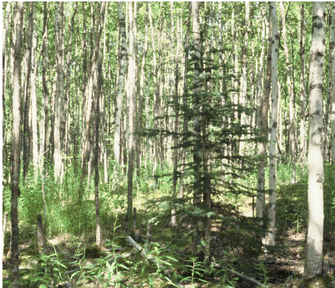
A forest ecosystem regenerated by fire.

Our Alaska forests provide useful timber products, habitats for wildlife, watersheds to protect and store water and reservoirs for hydroelectric energy. They also accumulate and store carbon, provide places for recreation and other important ecosystem attributes.