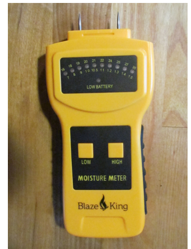
A moisture meter is a handy tool to check if firewood is dry.

Refer to this UAF site through the Institute of Agriculture, Natural Resources and Extension to get more firewood information: https://www.alaskafirewoodinfo.com/