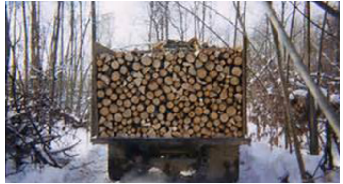
Measure the load of wood you buy to see if it is 128 cubic feet, a cord.

If buying firewood, treat it like any other utility. Buy from a reputable dealer. A cord of firewood is a stacked unit that measures 4-feet tall by 4-feet wide and 8-feet long. A cord equals 128 cubic feet. A pickup bed 5-feet wide by 6-feet long with firewood stacked 4.3 feet high is also a 128 cubic foot cord of wood.