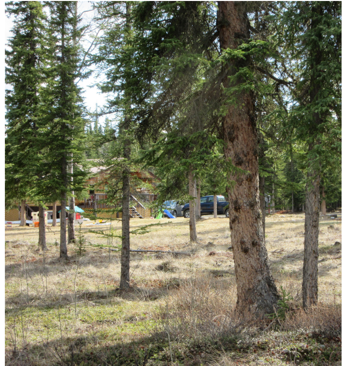
Active small-scale management can be critical to wildfire defensible space.

My project was in the verdant Southeast Alaska temperate rain forest. Trees grow quickly here. The cut created an additional forest age class, size and structure of forest habitat. The cut will soon regenerate similar species at the small size.