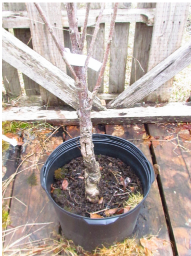
This tree was left unsold due to stem injuries or canker.

purchase. Certainly, the same season in which they are purchased. Trees and shrubs can be stored in their container and watered as needed until time and site conditions allow planting. Spring planting is fine but can be accompanied a drying period with little rain, so water them as needed until it rains.