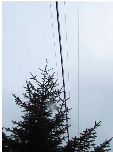
Planting near power lines can cause power outages and fires.

The shovel is the tool of choice and most often used when planting a few trees. Planting your tree/shrub where it is most likely to survive long term is very important. Here are some suggestions to make your planting successful: