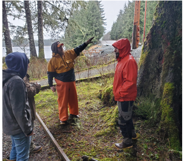
Participants practice skills such as tree identification, field traversing and plot measurement.

Other entities in Alaska are also looking to manage some of their land for carbon credit certification. Carbon credit forest management requires periodic field monitoring and inspections to determine carbon accumulation.