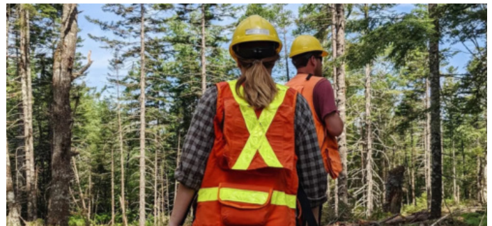
Career opportunities are abundant for women in natural resources.

When my career began, if you studied forest manage-