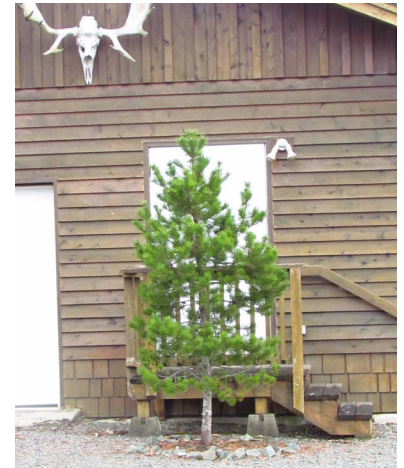
Plant the tree or shrub where it won't block access.

Water the tree in the pot prior to planting so the soil around its roots is moist but not soaking. Pot soil should stick to the roots and not fall away from the roots by being too dry when the pot or wrap is removed. Set the unpotted tree in the dug hole adjusting its depth using soil dug from the hole. Fill in around the roots making the plant soil even with the top of the dug hole. Don't plant too deeply, which may cover part of the stem and also not too shallow, which may expose, kill or injure some of those critical roots.