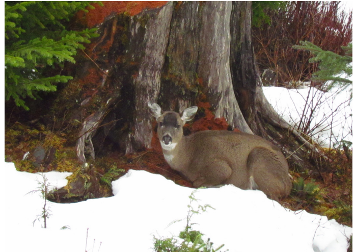
This cut preserves three-season habitat for Sitka black-tailed deer.

Private companies able to manage small landscapes in the rural-urban interface can assist residents allowing them to minimize wildfire risks and improve their properties for a variety of forest land ownership outcomes.