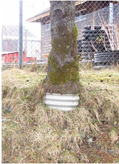
Planting a tree in a small enclosure can create future problems.

Obtain trees and shrubs from a reputable local nursery because they will more apt to match local growing conditions including the climate, soil conditions, and length of growing season. Avoid buying trees on sale at the end of the season. They are often those that others didn't buy because of physical flaws, and are also often root bound from being in the pot too long. Buy good growing stock.