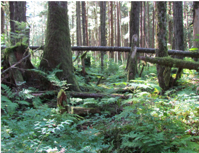
Land in Tongass National Forest may be selected.

The law establishes a framework for the university to work with the state Department of Natural Resources to jointly identify up to 500,000 acres of federal land to be conveyed to the state. It would require the Bureau of Land Management to survey the selection and work with UA to transfer up to 360,000 acres of state land to the university. The UA Lands office already has selected 200,000 acres and provided the selection to DNR for review.