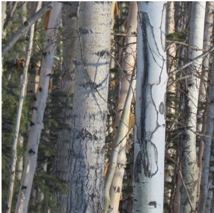
Aspen/birch is boreal tree type "one" being studied near Fairbanks.

The study is focusing on two tree types: coniferous black spruce and deciduous aspen/birch in the Caribou-Poker Creeks Research Watershed near