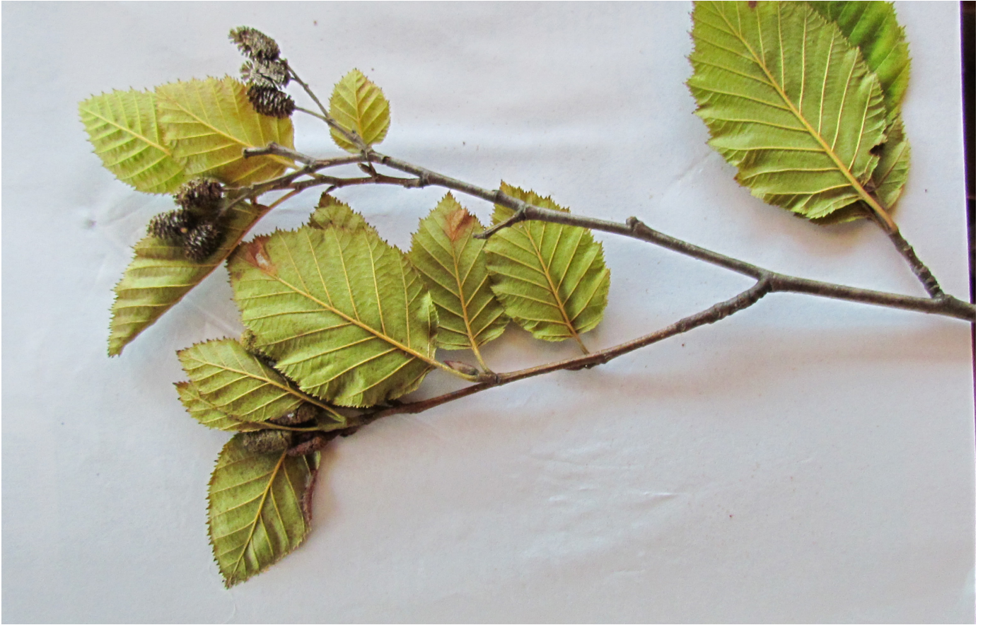
Alder is a common shrub in the boreal forest.