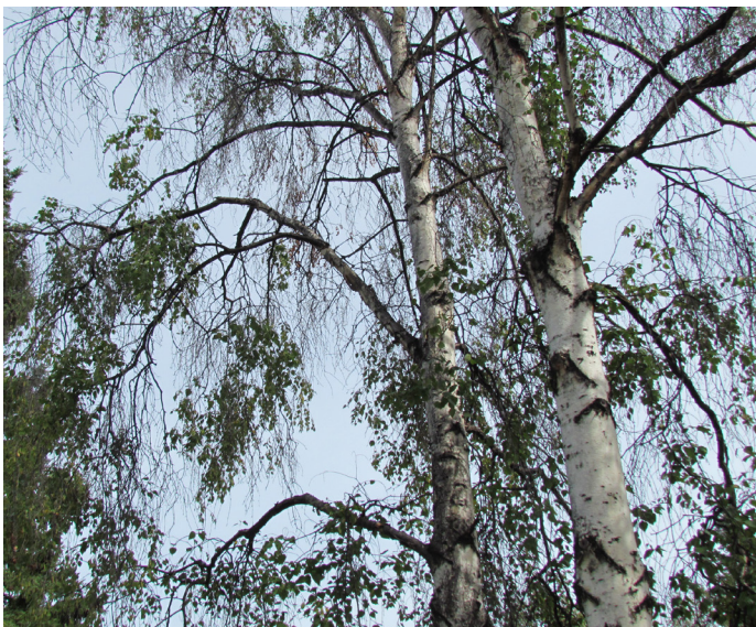
Drought can adversely affect tree health.

Adequate soil moisture can affect a tree's appearance, its ability to take up nutrients, its duration of photosynthesis and the length of growing season.