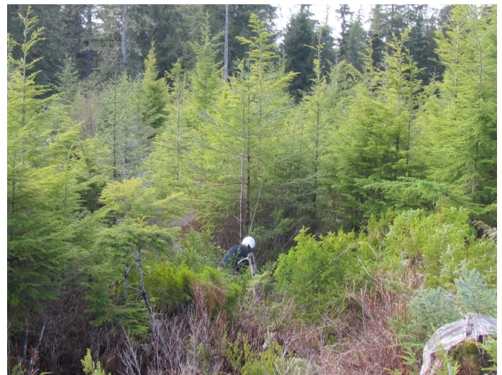
Recutting part of this 15-year-old clearcut adds diversity to the forest.

Risks to the structure, function, health, productivity, and the safety of forests whether through insects like spruce beetle ( Dendroctonus rufipennis ); or wildfires are being studied nationwide to determine whether “hands off” is the “best management practice” choice.