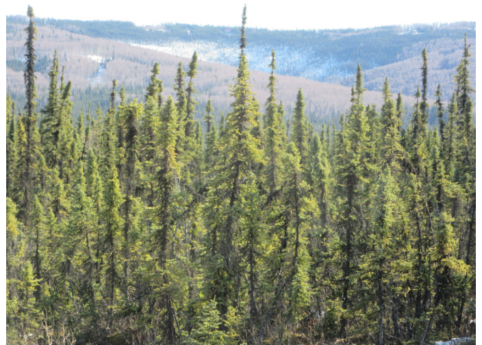
The boreal black spruce forest is the second type of forest being studied.