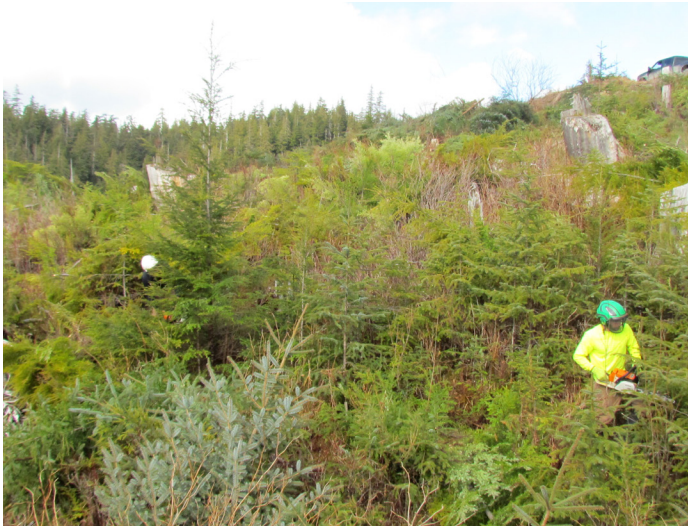
Professional tree cutters reduce forest fuel size and fuel loads.