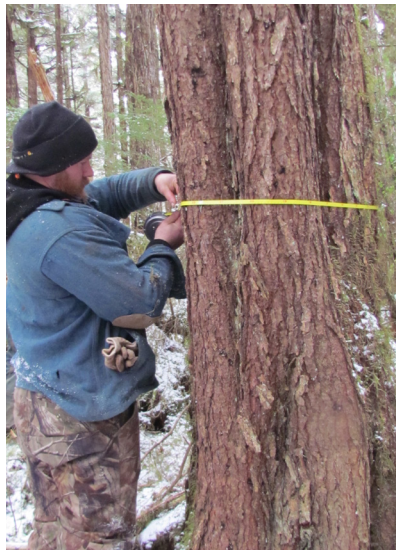
Forestry skills-based training in Klawock trained participants to properly measure tree diameters in the field.

A field training Natural Resource Academy is being developed by Sealaska Corp., which is partnering with Southeast Alaska Sustainability Strategy. The U.S. Forest Service is funding the academy, which is being delivered through VOTECH in Klawock. The academy will provide field certification to Alaskans working with and in forestry as a career. Participants' main function will be to measure forest growth as it accumulates credits for monetary revenue.