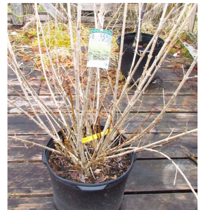
Older left-over potted trees can be root bound.

After filling the hole in around the tree roots, firmly tamp the soil down around the roots, making sure to cover them all.