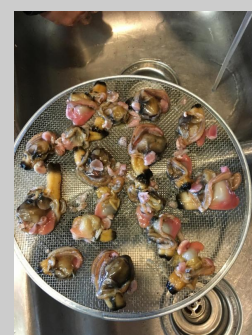
Clams ready for testing

Field work began in April with the collection of the first shellfish samples, and Matweyou will continue to work closely with, and train project technicians to monitor seawater salinity and temperature and collect monthly shellfish samples through September 2016. Youth engagement and education are vital components of the project.