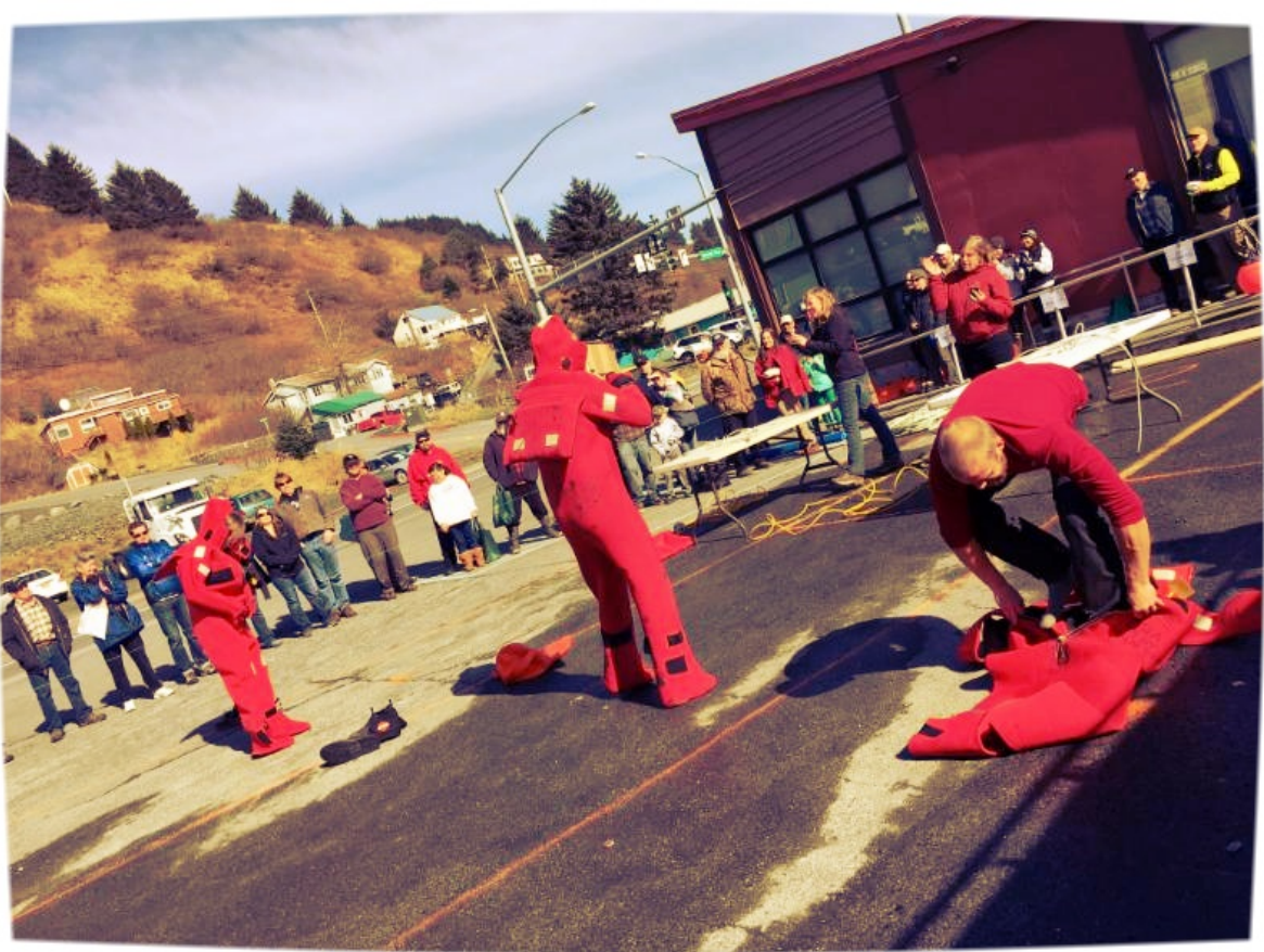
The participants in this round are neck and neck in the last event of the heat - Survival Suit Donning_