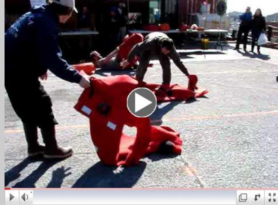
Video of the Final Heat of the 2016 Fishermen's Showcase